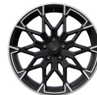
03_ WHEELS 19" SNOWFLAKE BLACK DIAMOND.