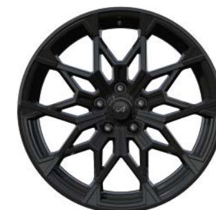
02_ WHEELS 19" BLACK SNOWFLAKE.