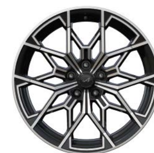
04_ WHEELS 19" SNOWFLAKE ALU DIAMOND.