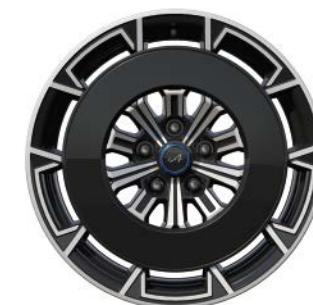
05_ WHEELS 19" SNOWFLAKE FLASK.