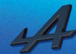
METALLIC ALPINE VISION BLUE