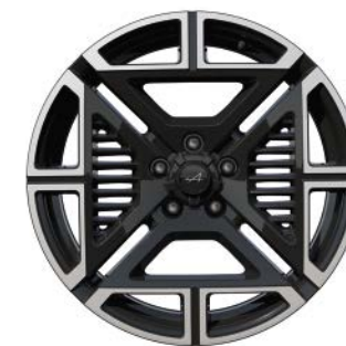
01_ WHEELS 19" ICONIC BLACK ALU DIAMOND.