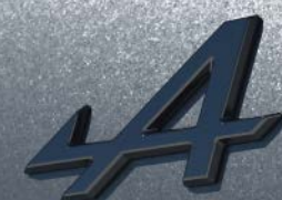
MATT TORNADO GREY