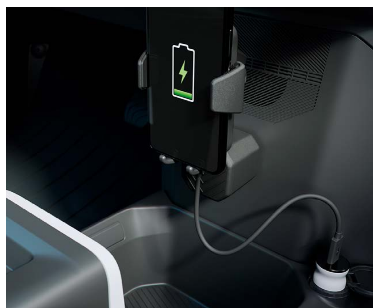
YOUCLIP WIRELESS CHARGER 283D84357R £41

Smart new accessories: YouClip. A simple and clever system for attaching a wide range of dedicated accessories to key locations in the passenger compartment in a practical and robust way. The clever 3-in-1 system combines a cup holder, bag hook and portable lamp.