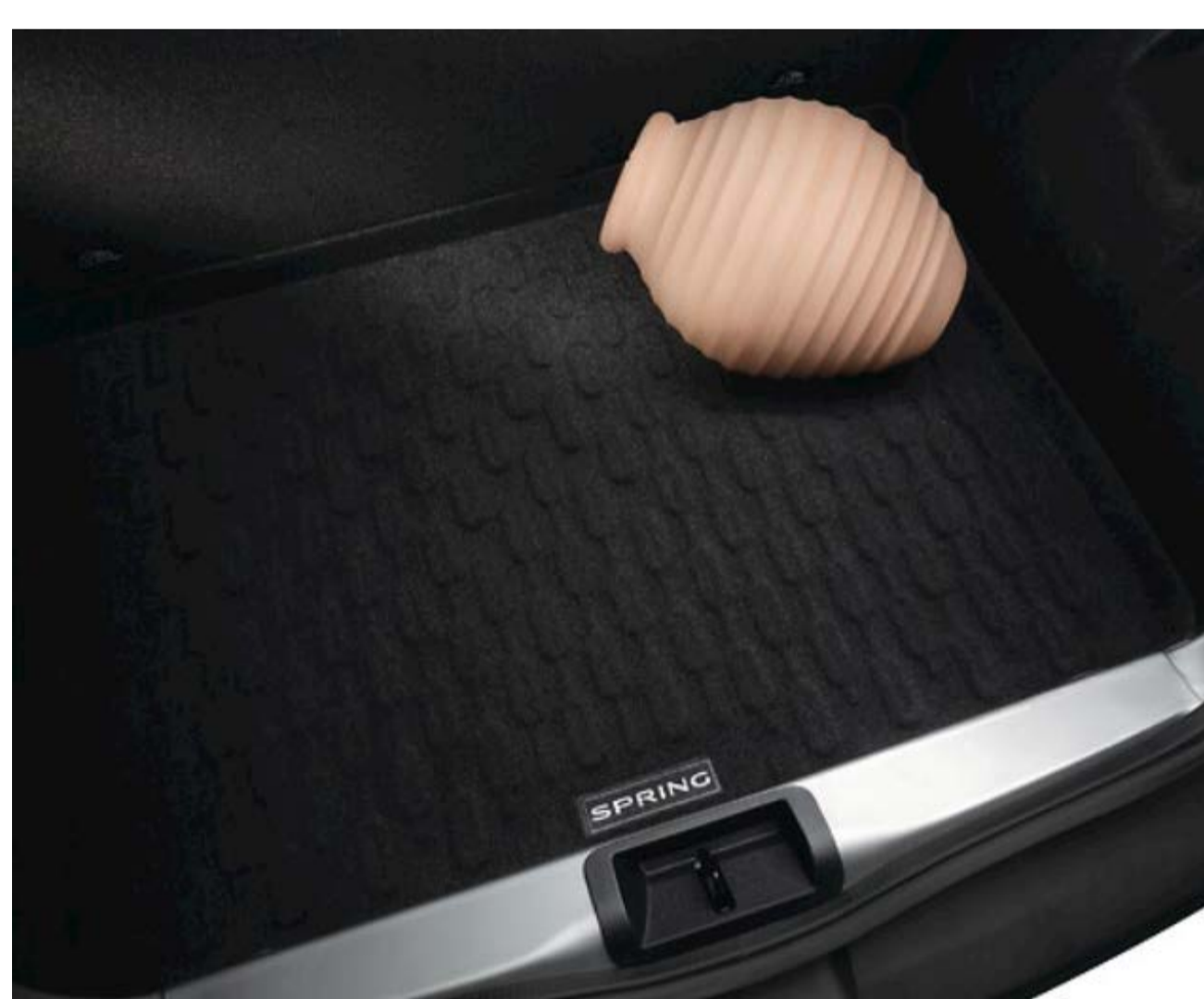
PREMIUM DELIVERY PACK Premium textile mats 8201756625 Safety kit 7711780759 Key card wallet 7717094928