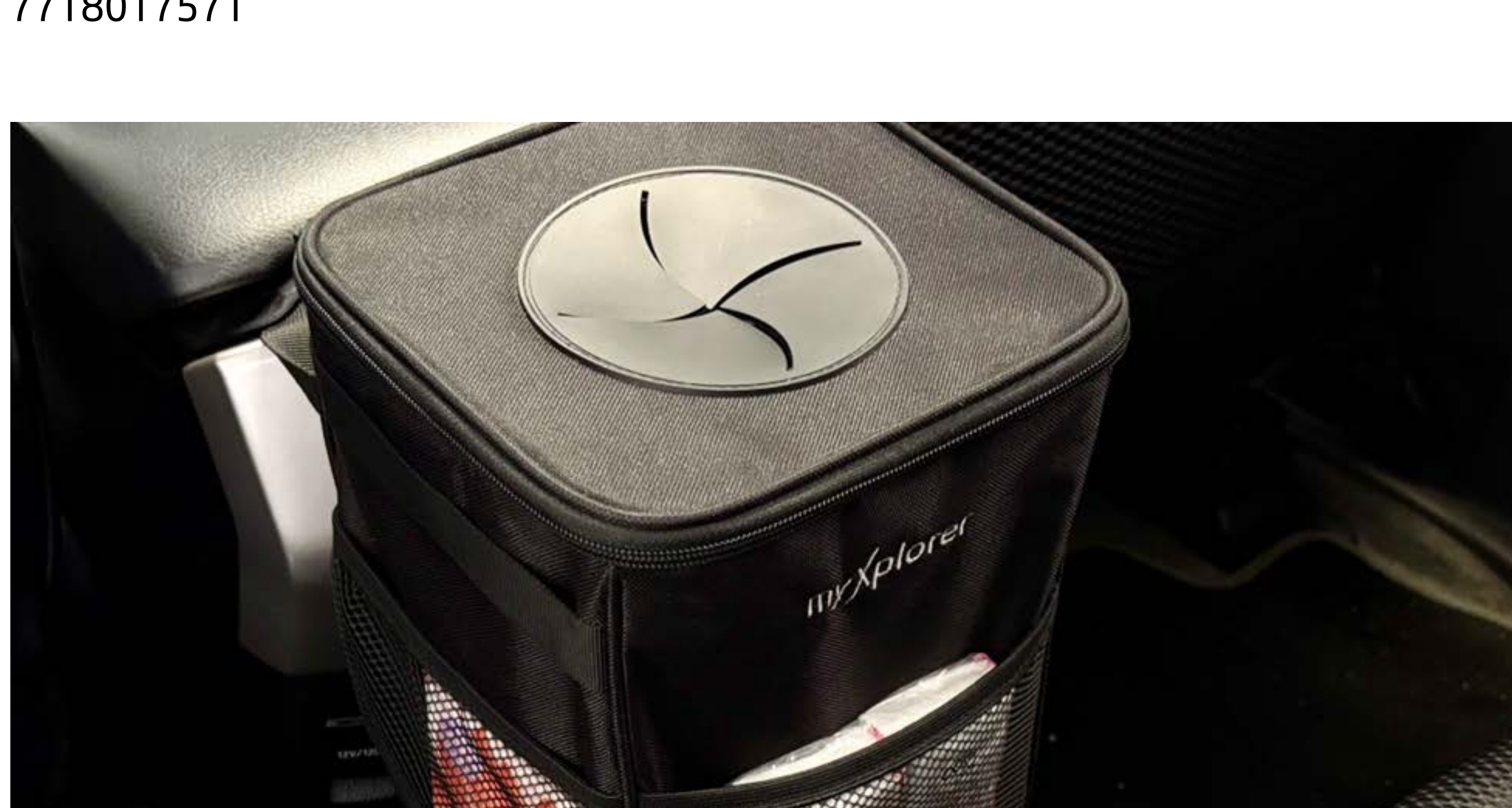
MYXPLOER BIN 7718017572