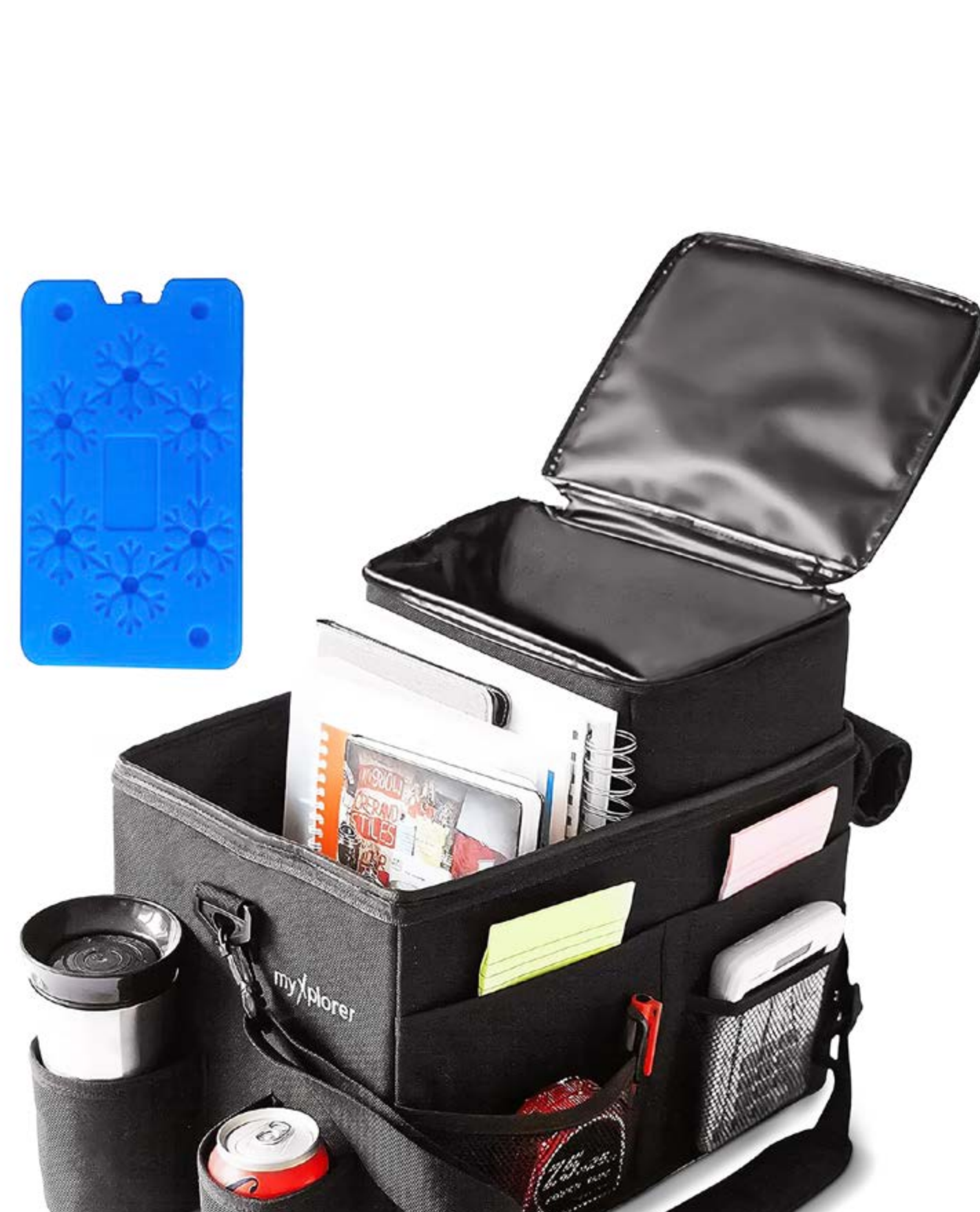
MYXPLOER ORGANISER BAG 7718017571