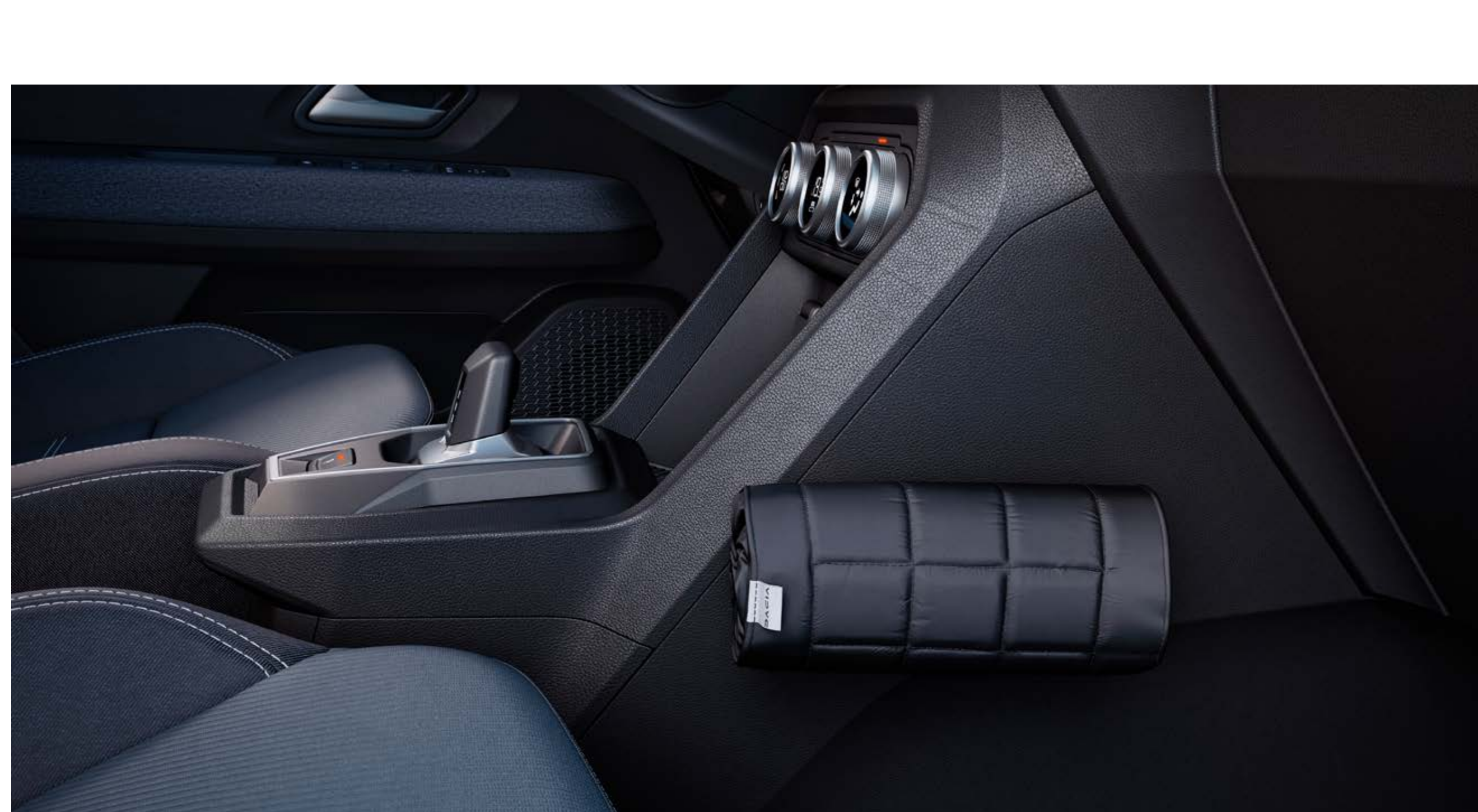
YOUCLIP - FOLDABLE SHOPPING BAG 984660166R £20