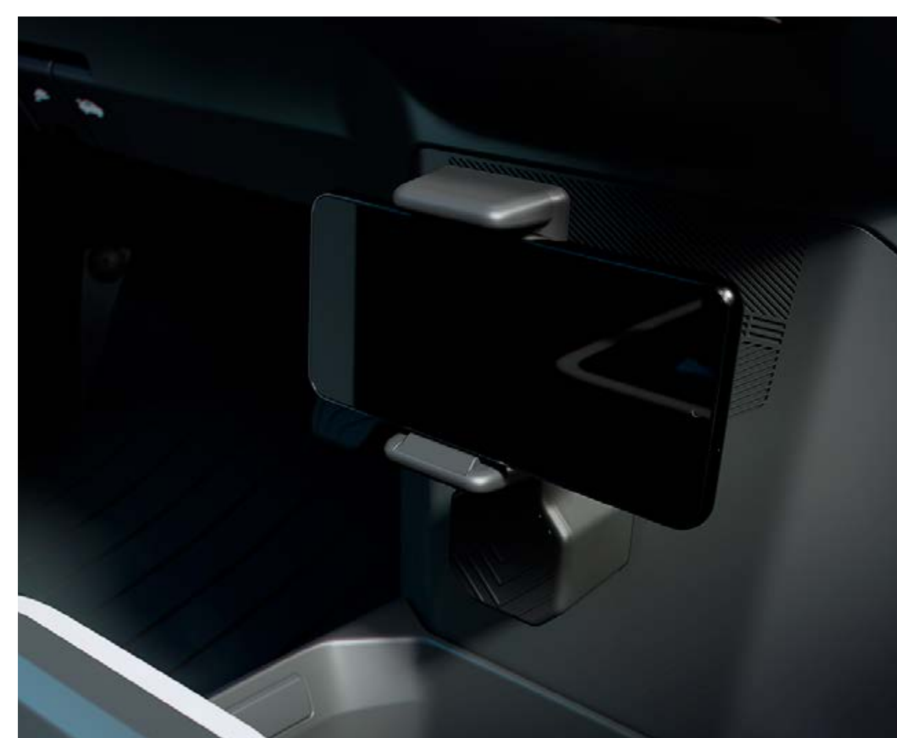
YOUCLIP SMARTPHONE HOLDER 283143468R £20