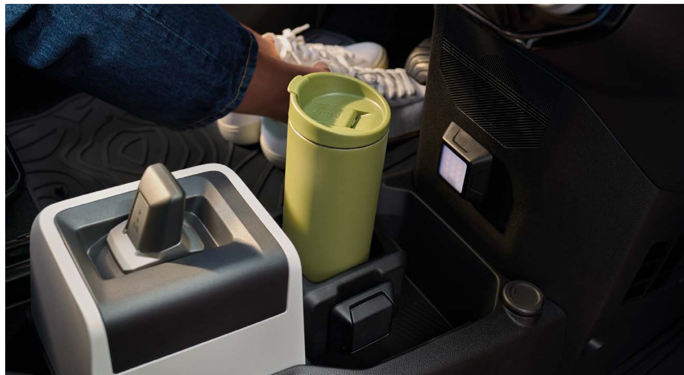
3-IN-1 YOUCLIP 984392908R £40

Smart new accessories: YouClip. A simple and clever system for attaching a wide range of dedicated accessories to key locations in the passenger compartment in a practical and robust way. The clever 3-in-1 system combines a cup holder, bag hook and portable lamp.