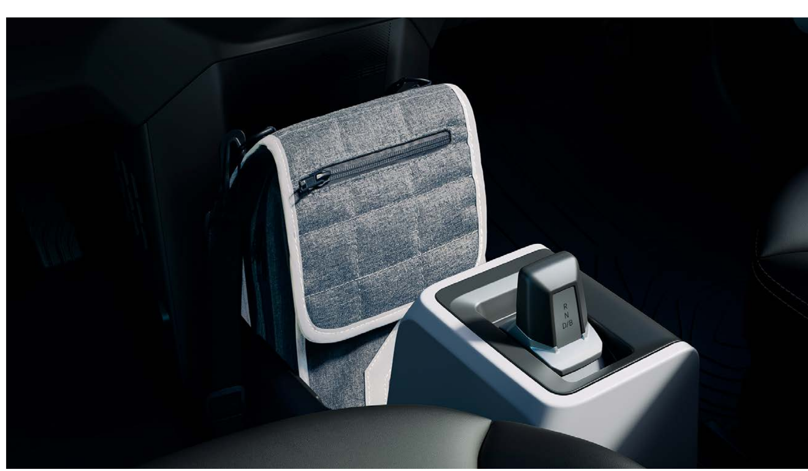
YOUCLIP POUCH 685605709R £35