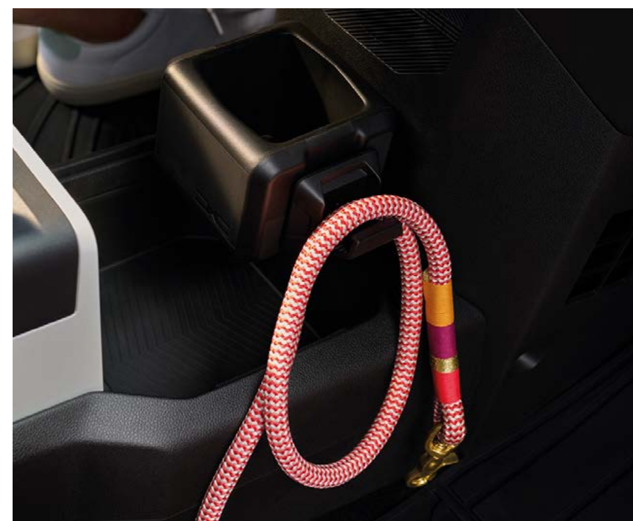
YOUCLIP HOOK 684344266R £10