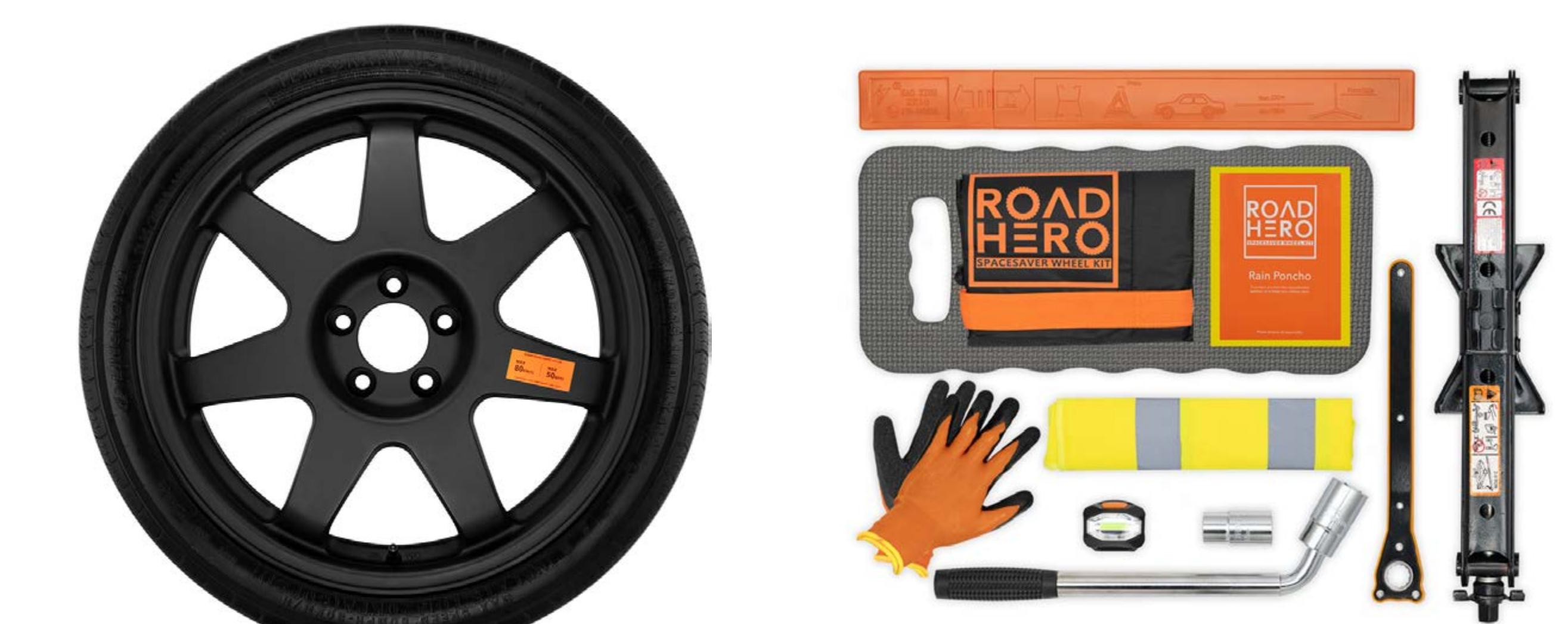
SPARE WHEEL KIT Spare wheel 7717094875 Kit 7717085170