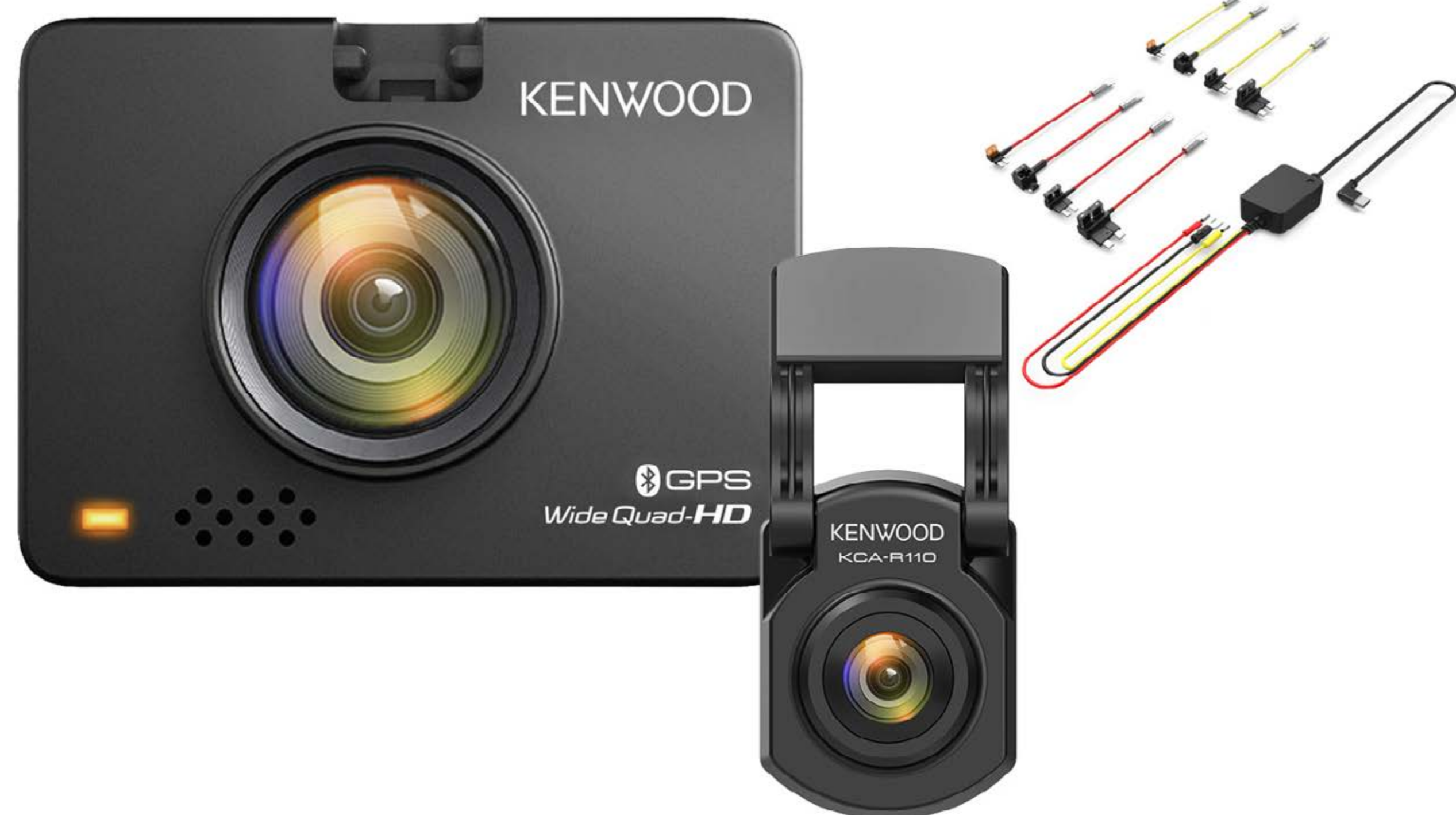
DASHCAM Front and rear dashcam 7717086531