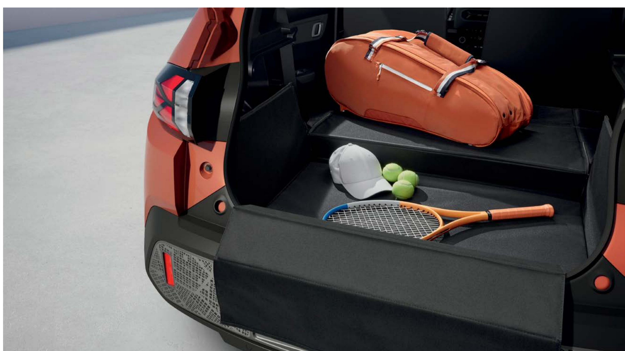
EASYFLEX BOOT LINER 8201740602