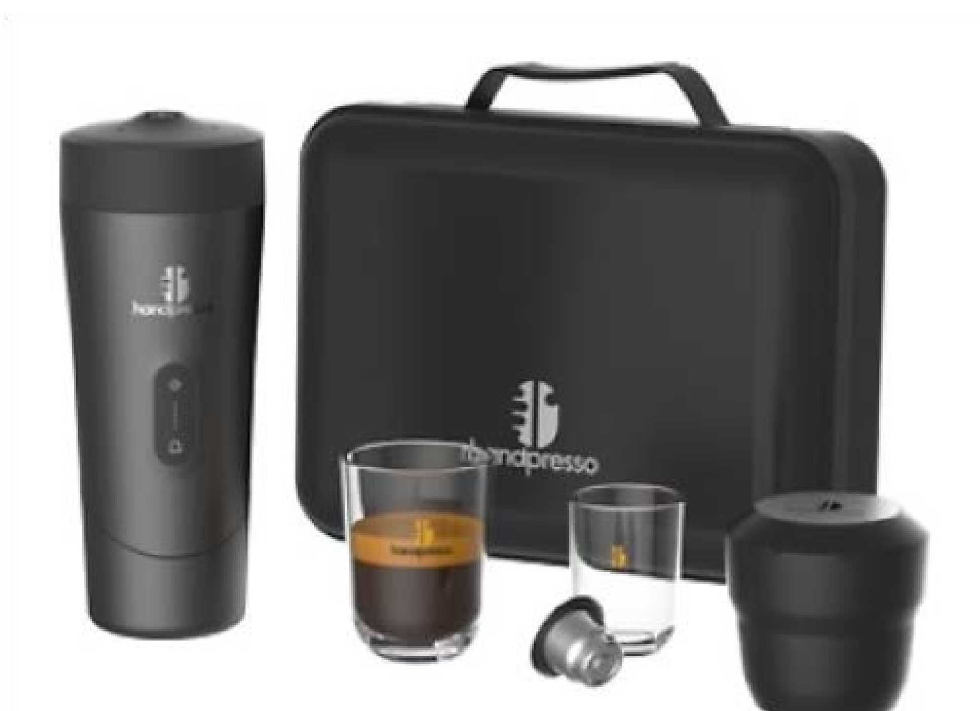
HANDPRESSO PORTABLE COFFEE MACHINE 7717281161