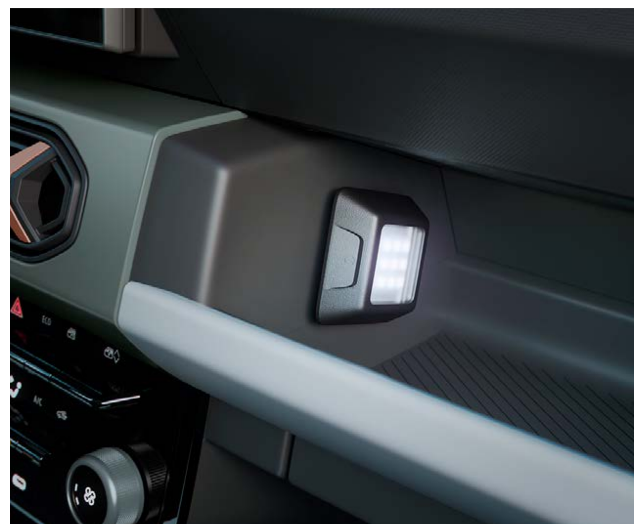
YOUCLIP LAMP 684342227R £21