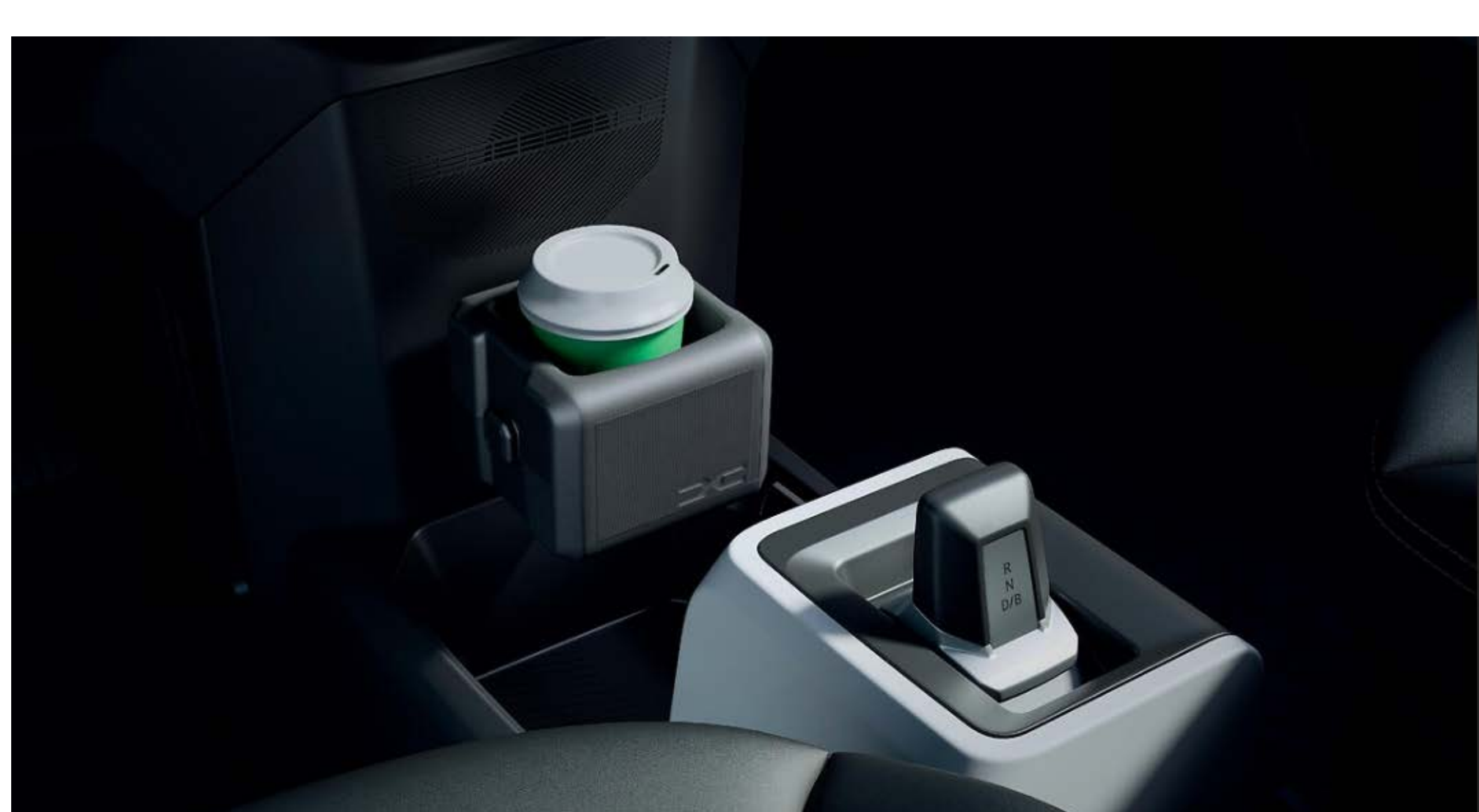
Cup holder 684349615R £15