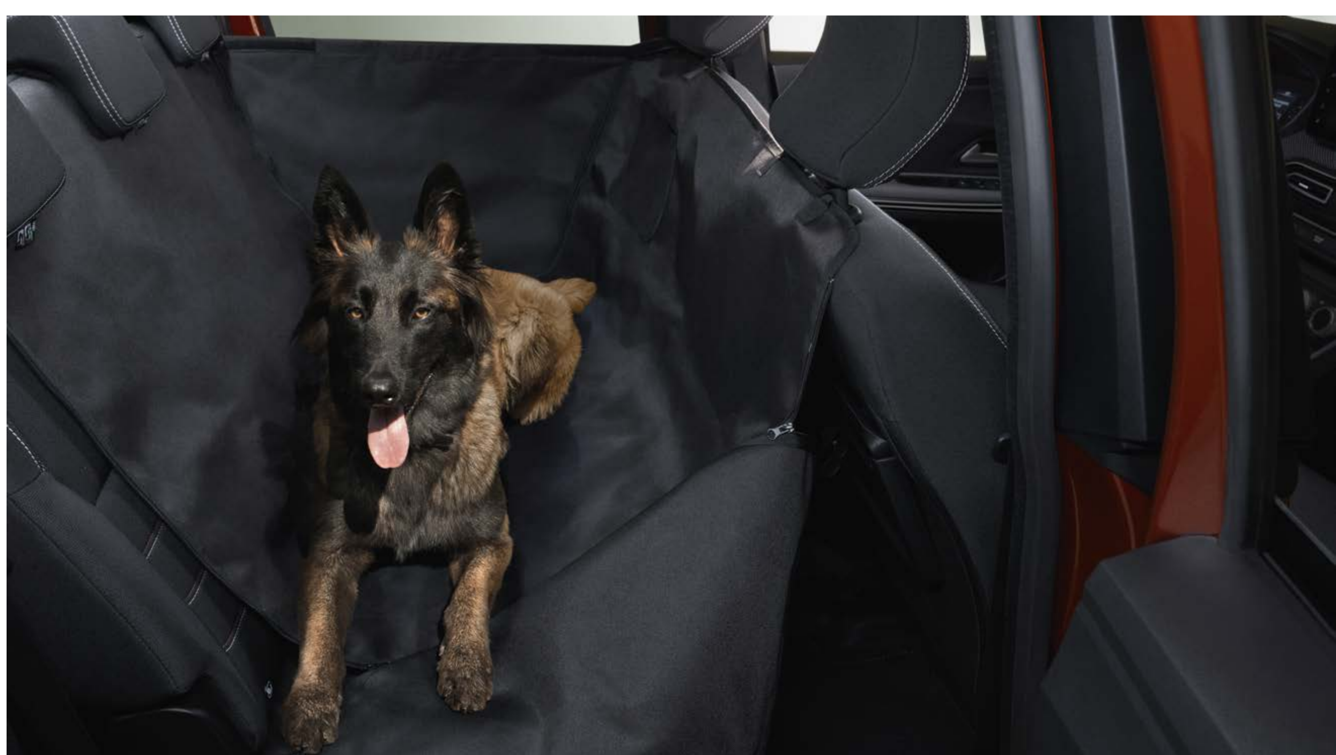
REAR SEAT PROTECTOR 7717101215