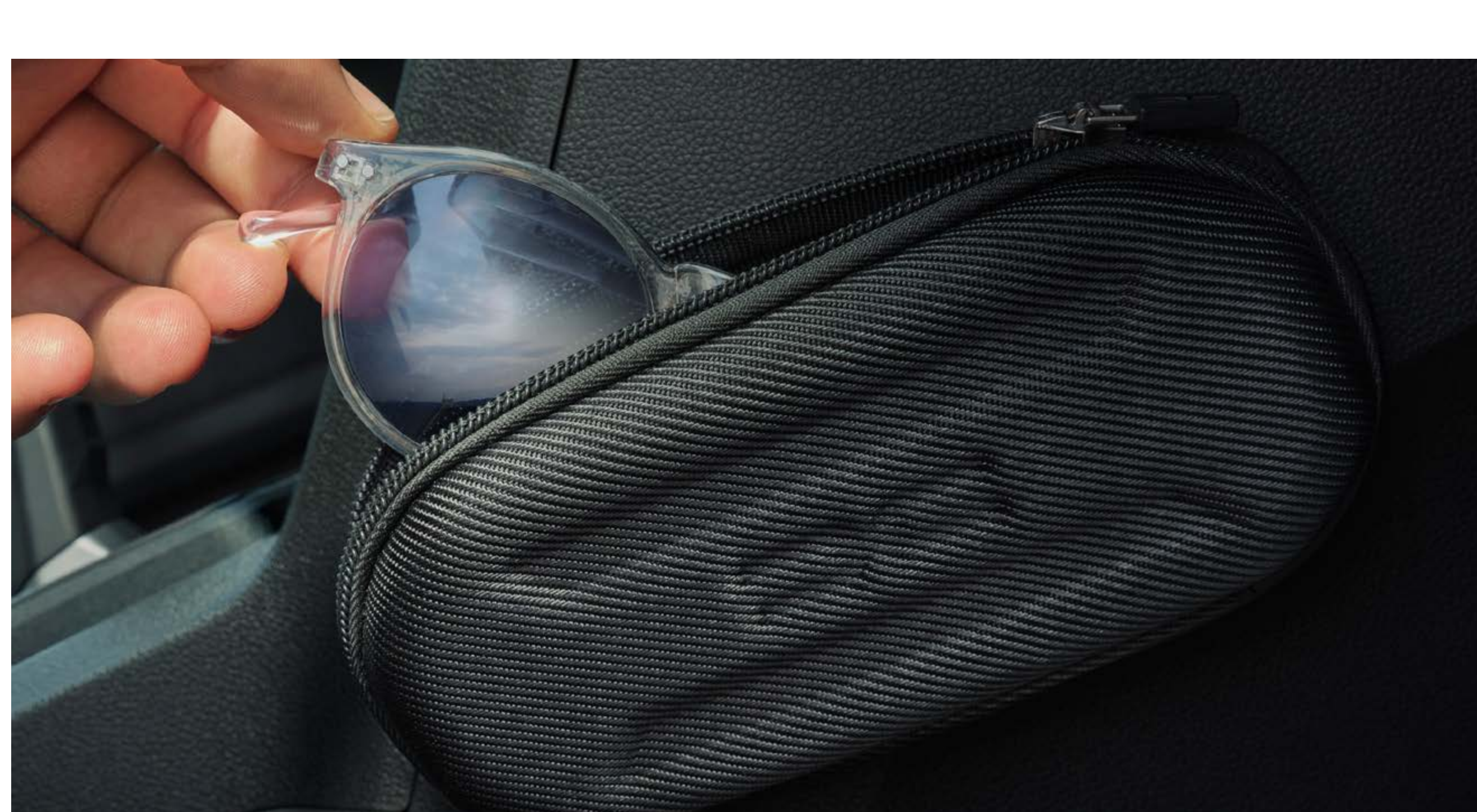
YOUCLIP - GLASSES CASE 739M00386R £25