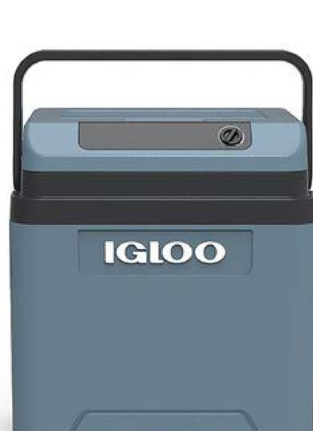
COOL BOX 7717277903

Connect the espresso machine to the cigarette lighter socket, add water and the Nespresso compatible capsule of your choice. In two and a half minutes, your coffee is ready!