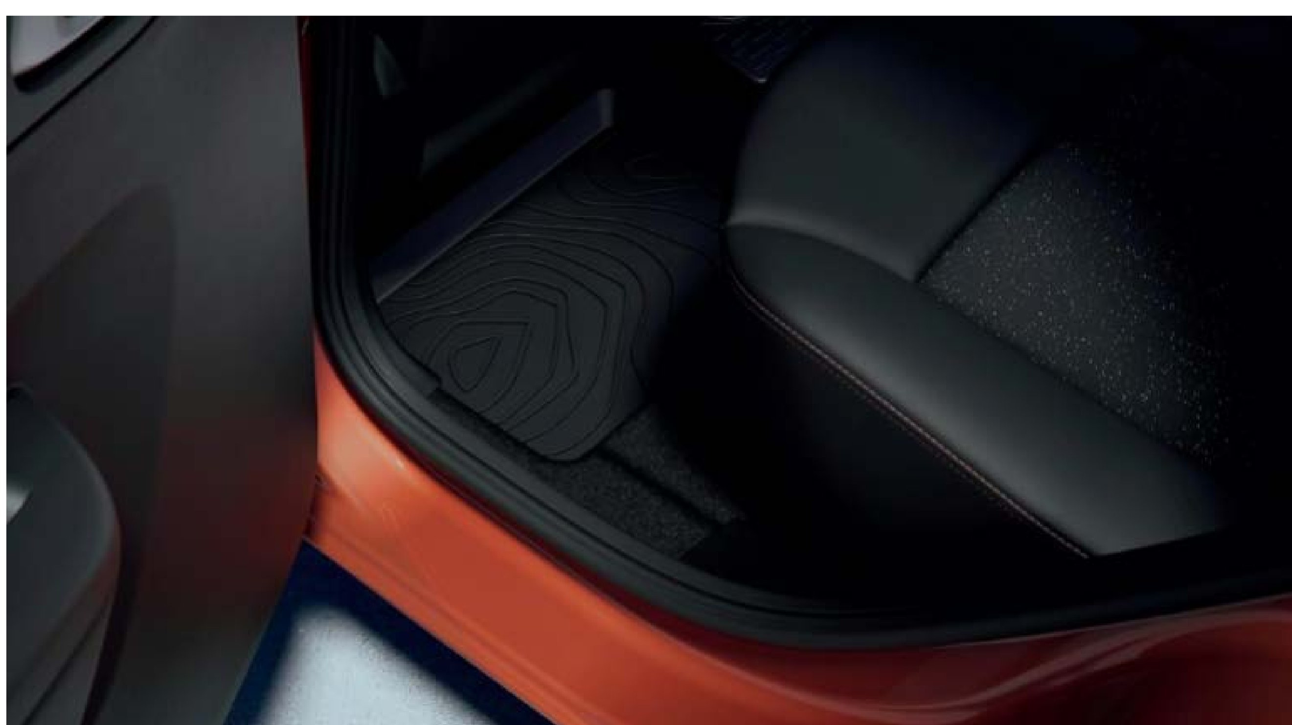
RUBBER MATS FOR REAR 749M60974R