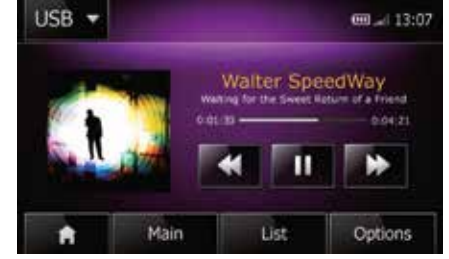
DAB/FM/AM tuner, connect devices via USB and AUX sockets.