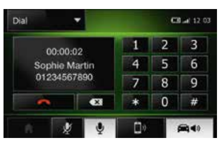
Bluetooth<sup>®</sup> technology<sup>*</sup> allows you to make and receive calls on the move.