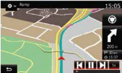
Provided by Navteq with vocal guidance.