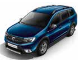
Cosmos Blue (RPR)