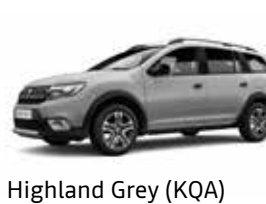
Highland Grey (KQA)