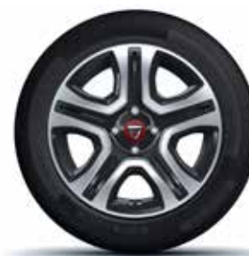
16" 'Flex Stepway Style' Alloy-look Wheels