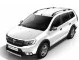
Glacier White (369)