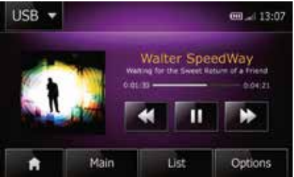
DAB/FM/AM tuner, connect devices via USB and AUX sockets.