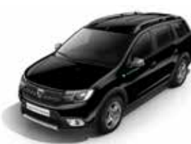
Pearl Black (676)