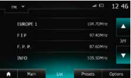
Listen to DAB, FM or AM radio.