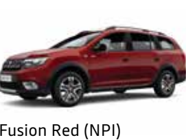
Fusion Red (NPI)