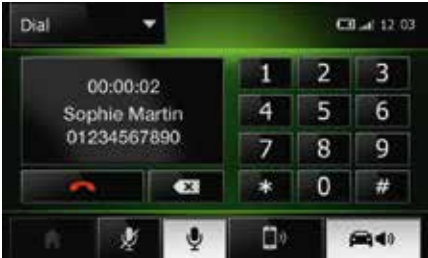
Bluetooth® technology* allows you to make and receive calls on the move.