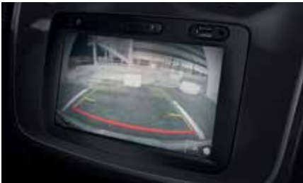
Reverse with ease in the Logan MCV Stepway Techroad