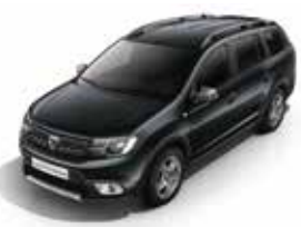
Slate Grey (KNA)