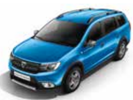
Azurite Blue (RPL)