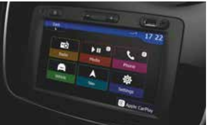
Connect your smartphone apps to your screen via Apple Car Play™ or Android Auto™