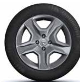
16" 'Stepway' Design Wheels

* Figures are obtained for comparative purposes in accordance with EU Legislation and may not reflect real life driving results.