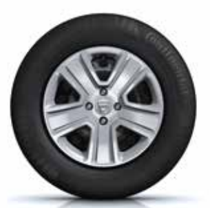
15" Lassen steel wheels