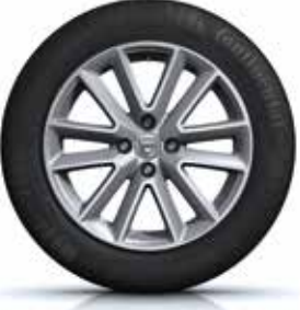
16" Taiga alloy wheels