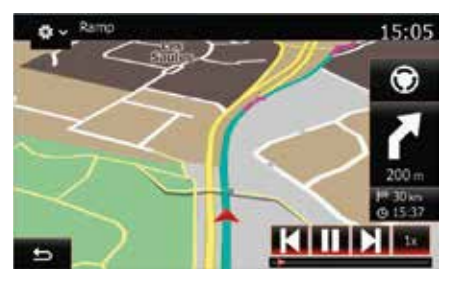
Provided by Navteq with vocal guidance. Listen to DAB, FM or AM radio.