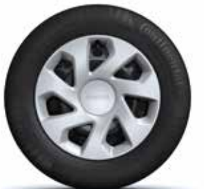
15" Tarkine steel wheels