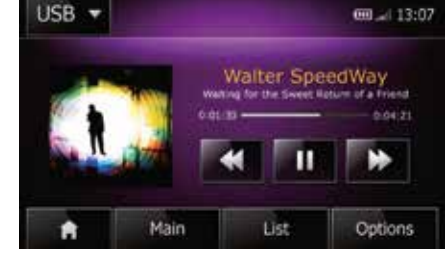
DAB/FM/AM tuner, connect devices via USB and AUX sockets.