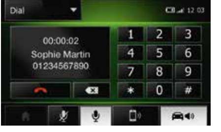
Bluetooth® technology* allows you to make and receive calls on the move.