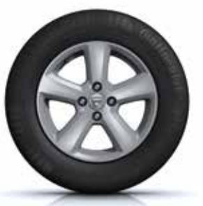
15" Sagano alloy wheels