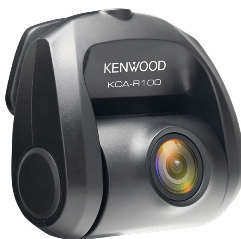
KENWOOD rear cam 7711599212