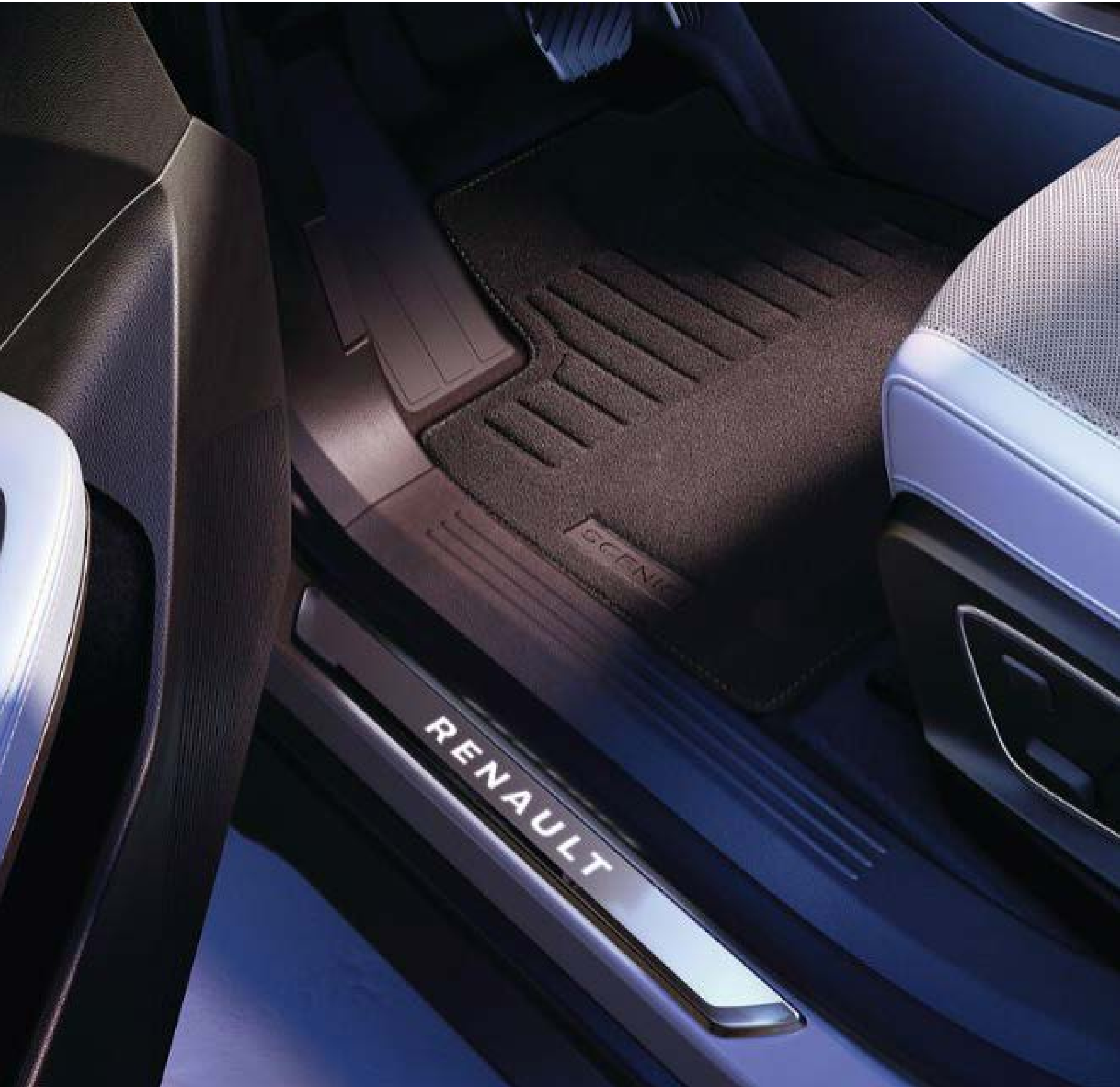
Illuminated door sills 8201731140