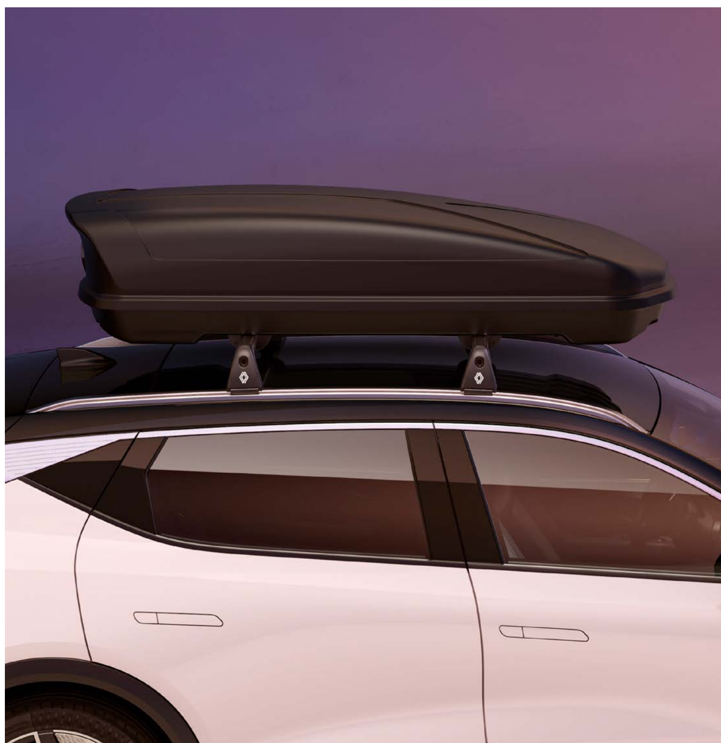
roof box 480L 7711948972