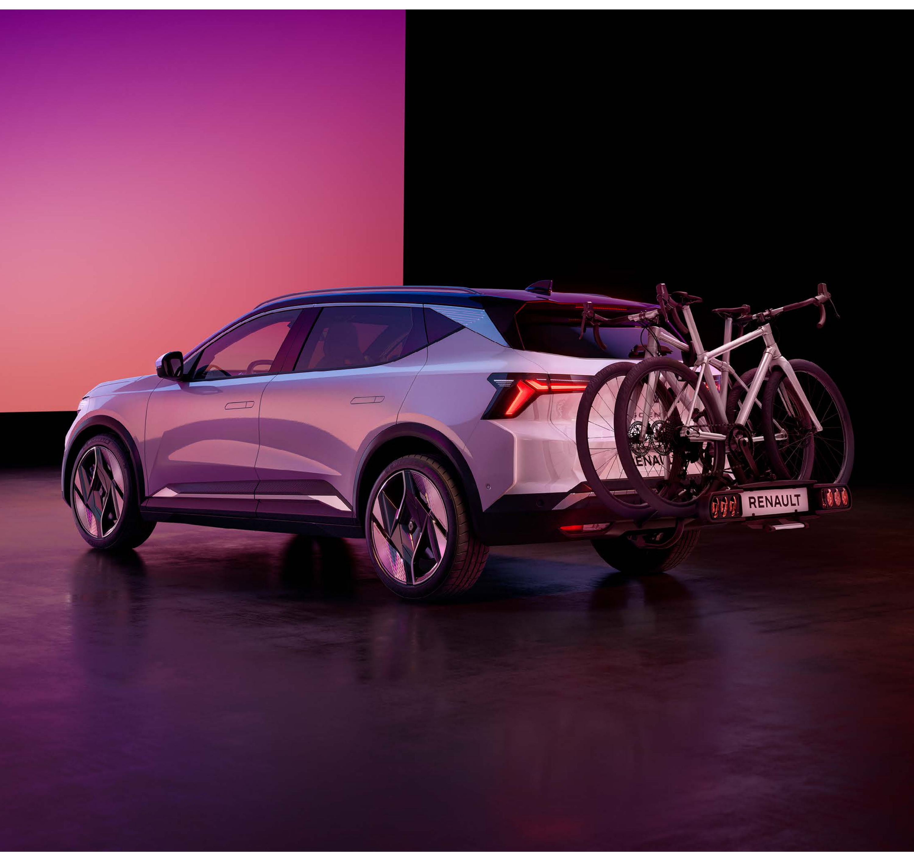
tool-free removable towbar pack and 2-bike rack on towbar

Equipped with a towbar, Renault Scenic E-Tech 100% electric can tow up to 1.1 t and easily transport a bike rack (75 kg of vertical load).