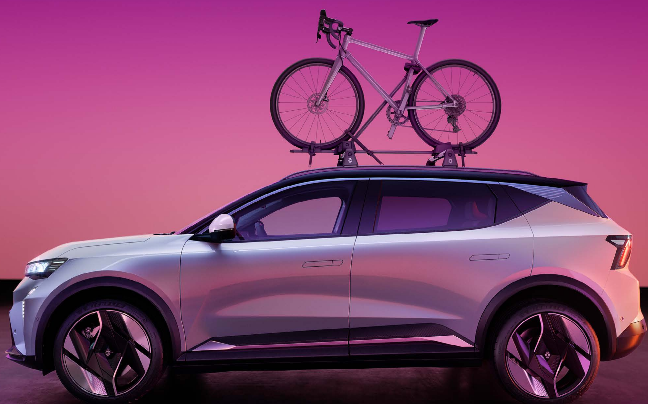
roof-mounted bike rack bars

Choose from our range of touring accessories, bicycle racks and towbars.