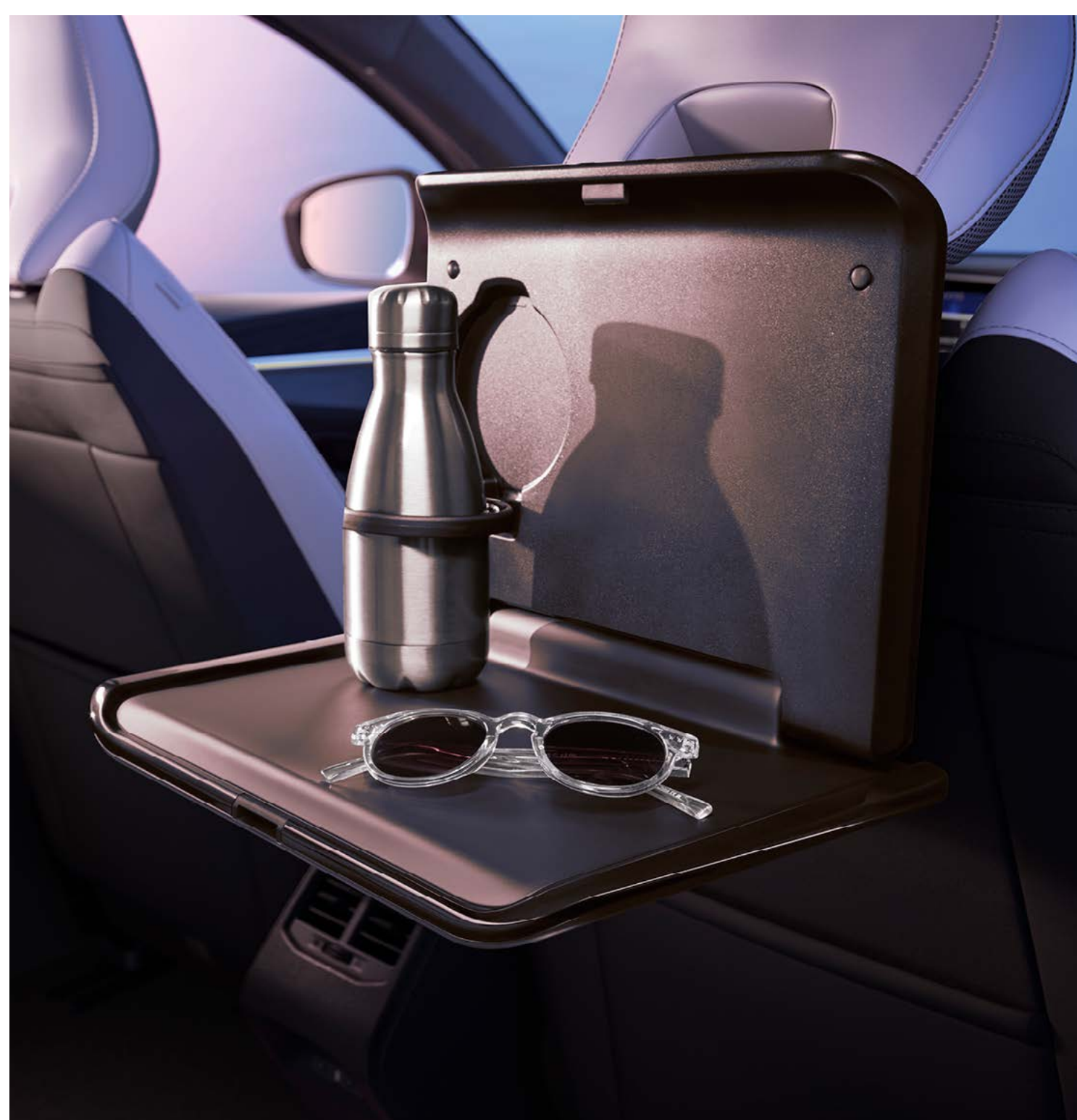
rear tray table 7711785947

storage pack + available with 2 tray tables & 2 fixings £252.