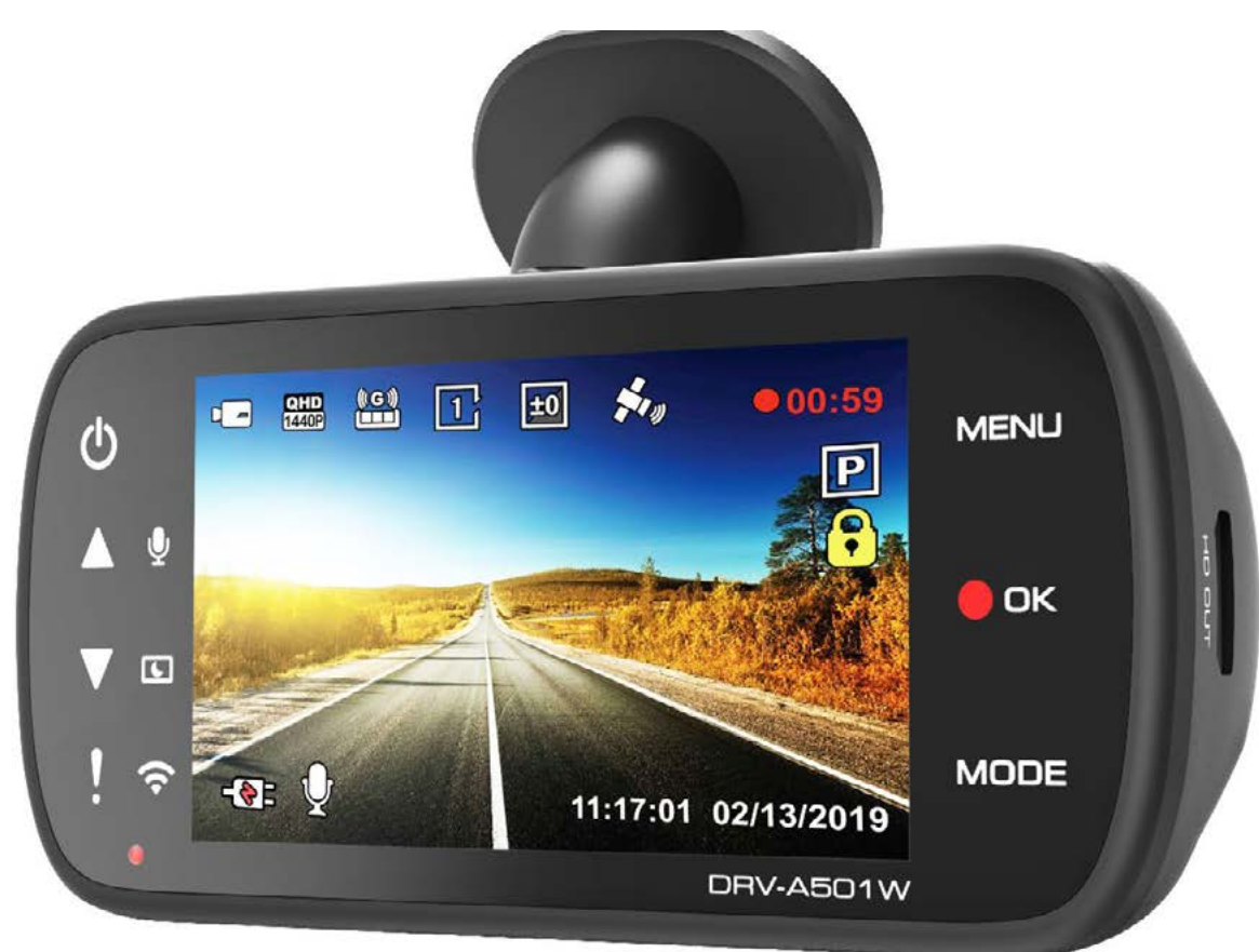
KENWOOD front dash cam 7711599197