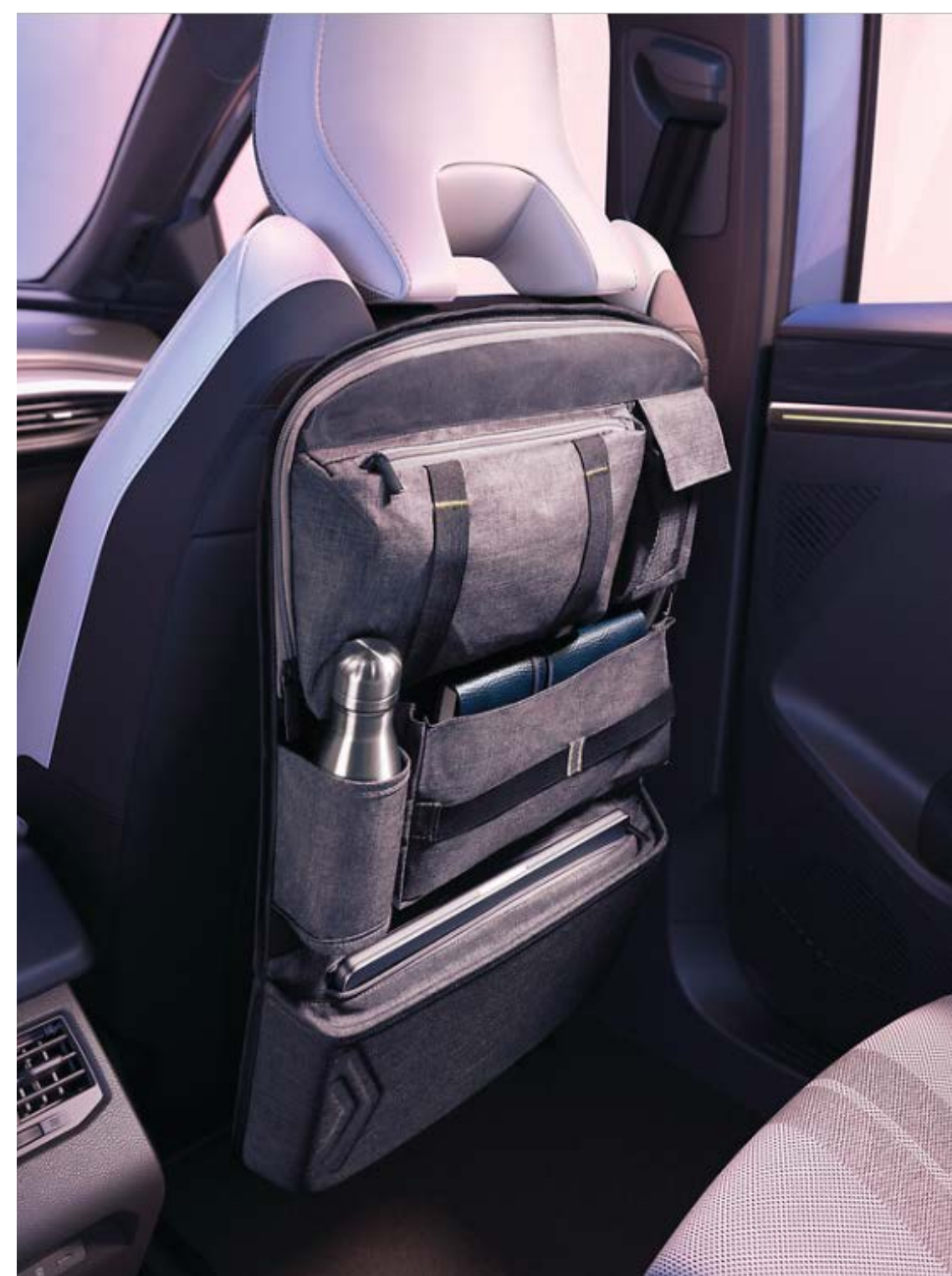
seat organizer 7711948825

The Renault mudguards protect the underbody and wheels from water, mud splatter and flying gravel.