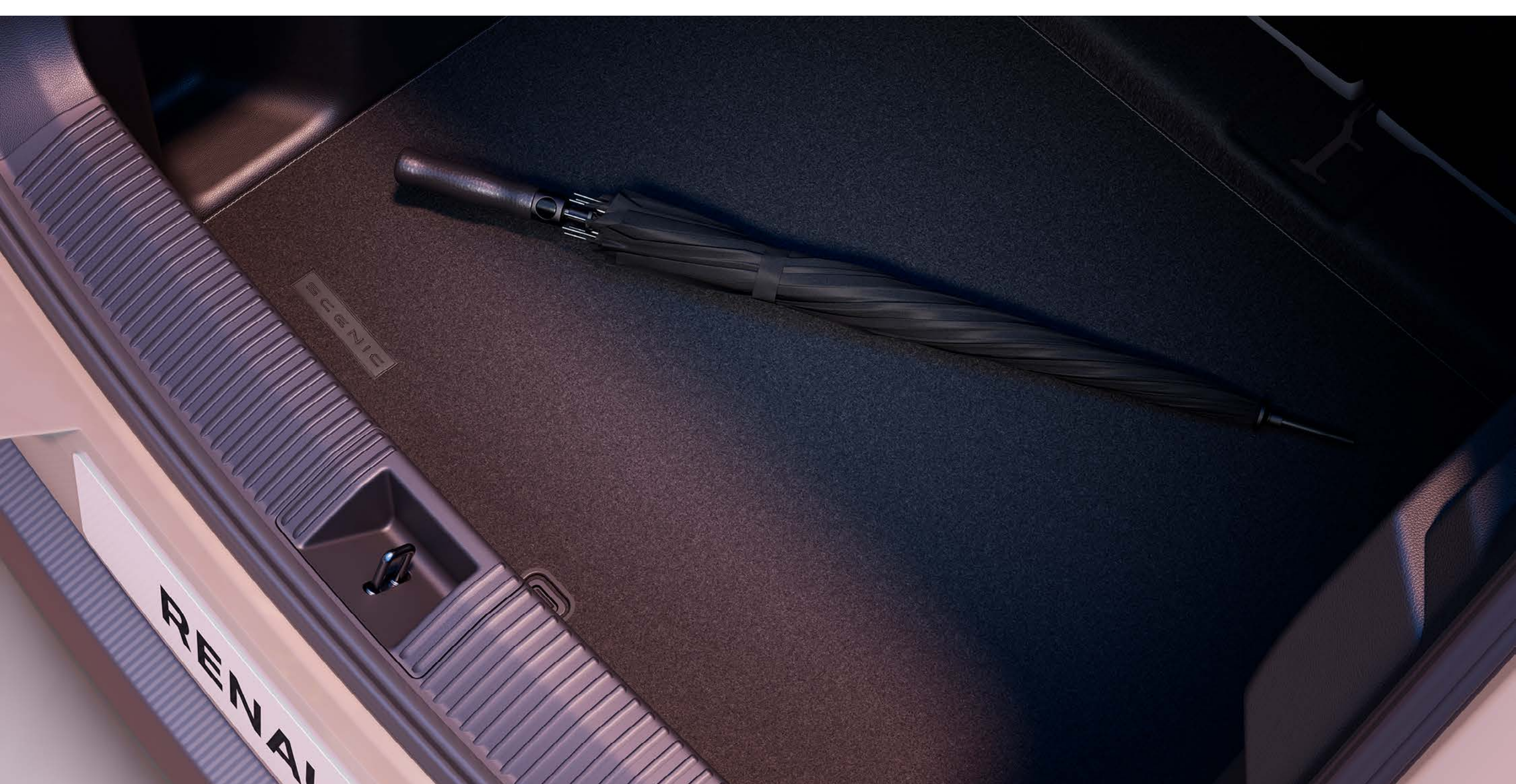
boot liner 849P74058R