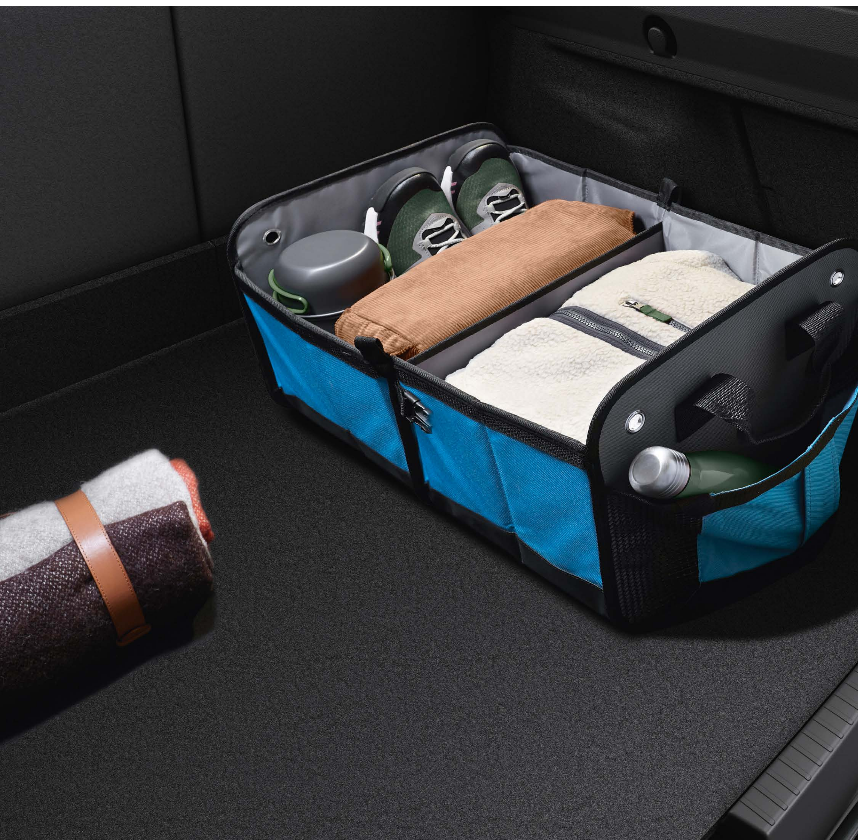
Compartmentalised boot storage box 7711940885