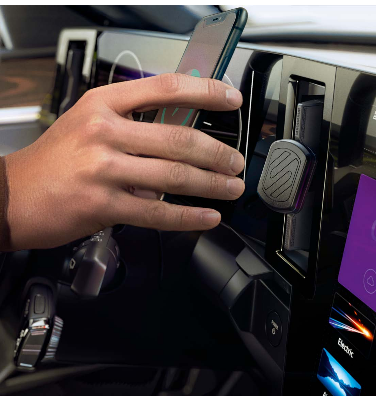
magnetic vent-mounted smartphone holder 7711784774