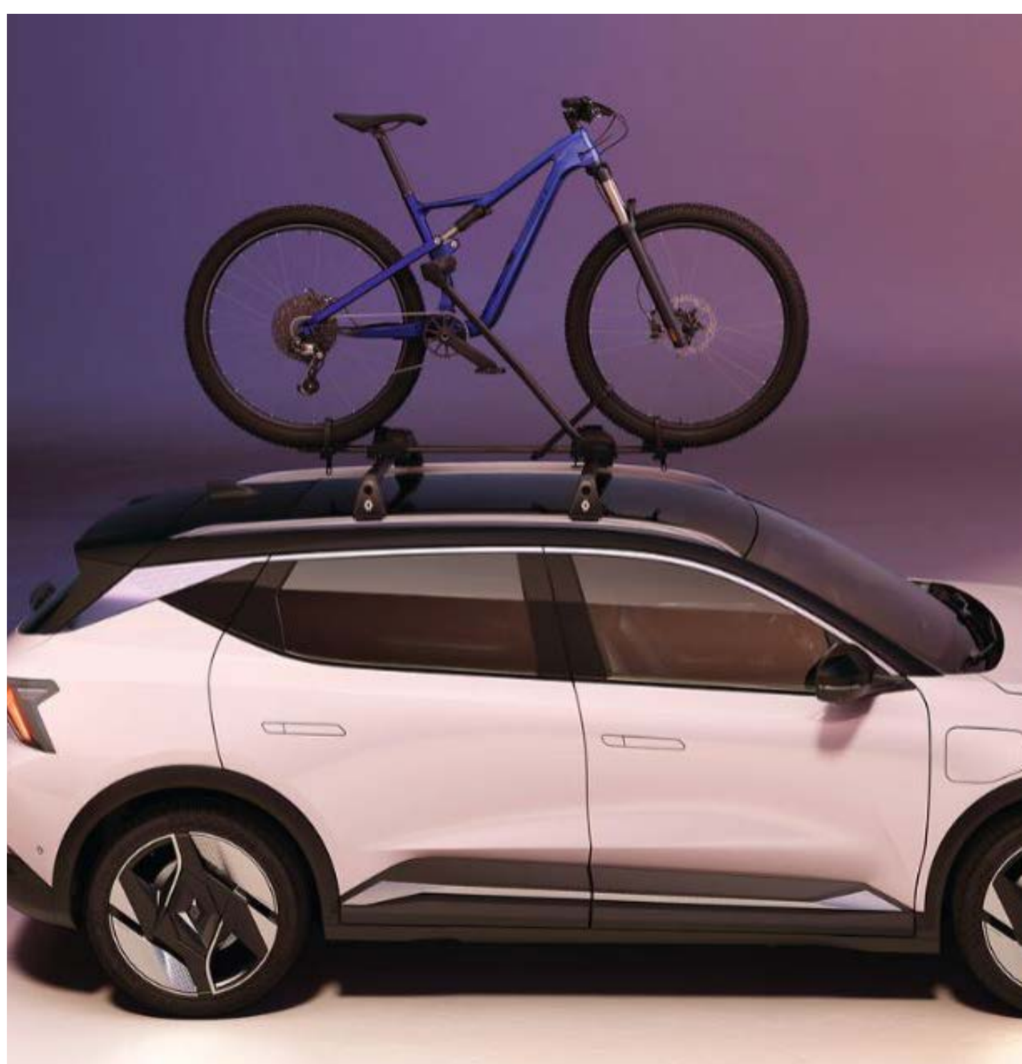
roof mounted bicycle carrier 7711949992 x 2