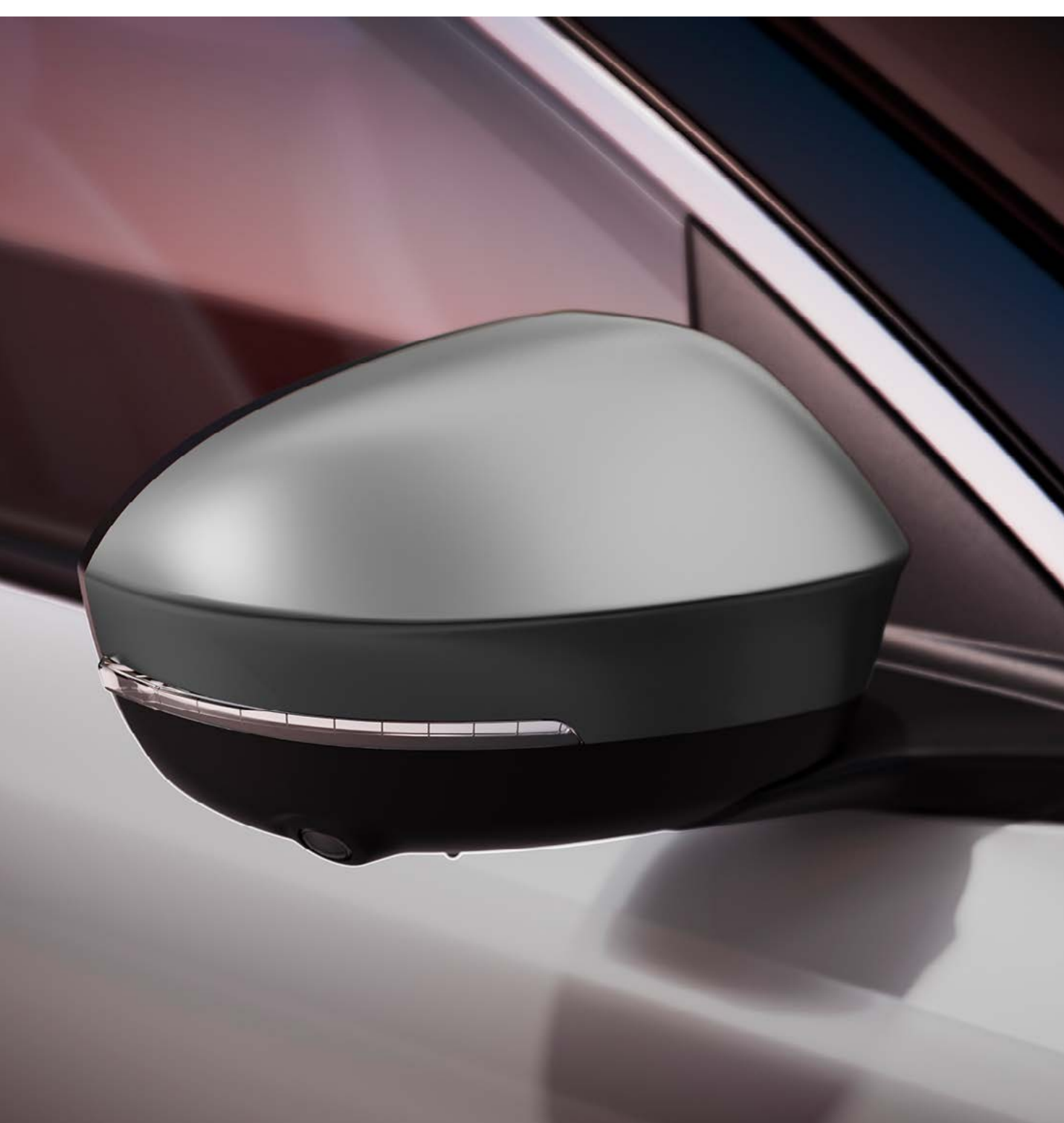
satin metal grey