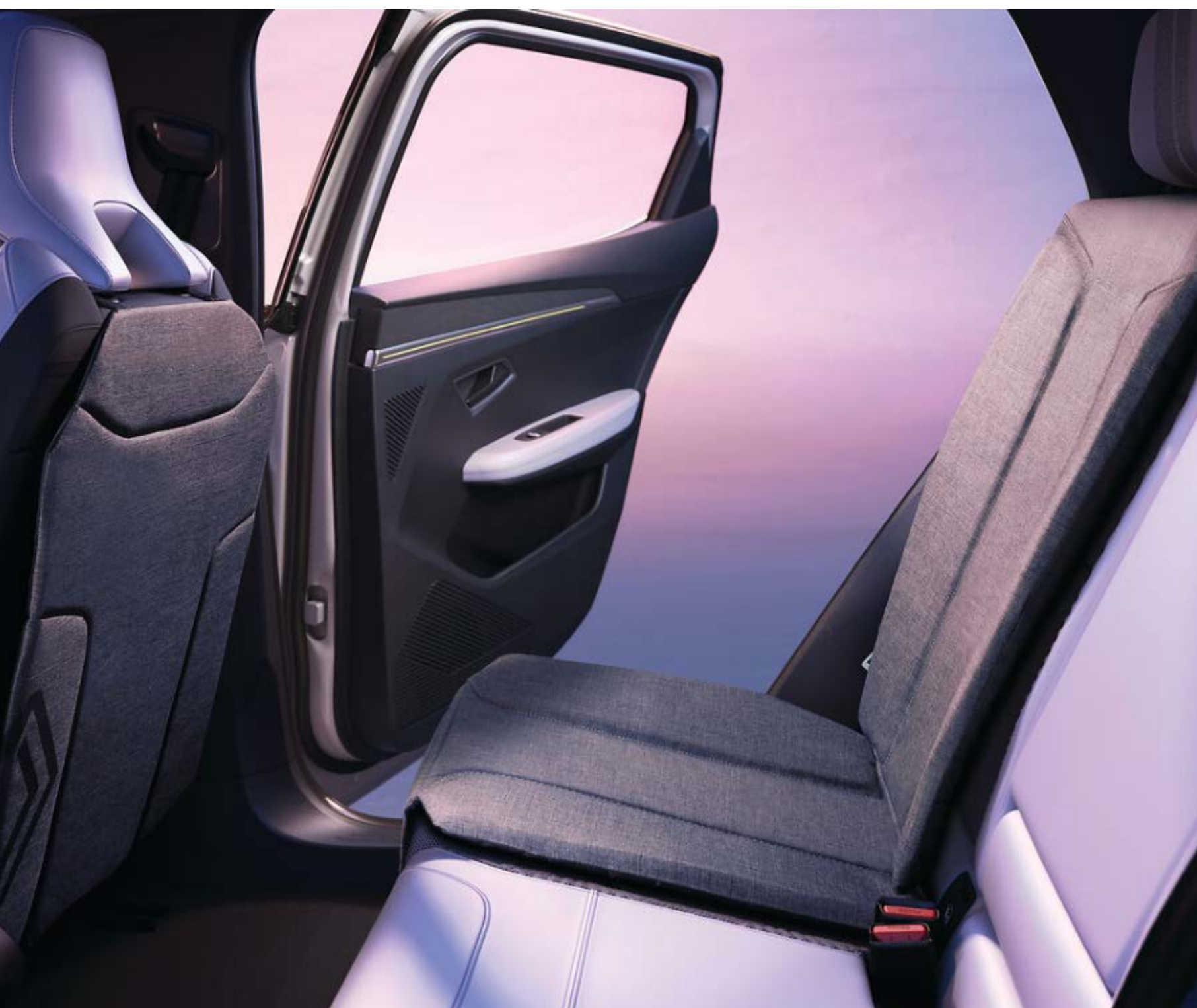
rear protection for child seats 7717300448