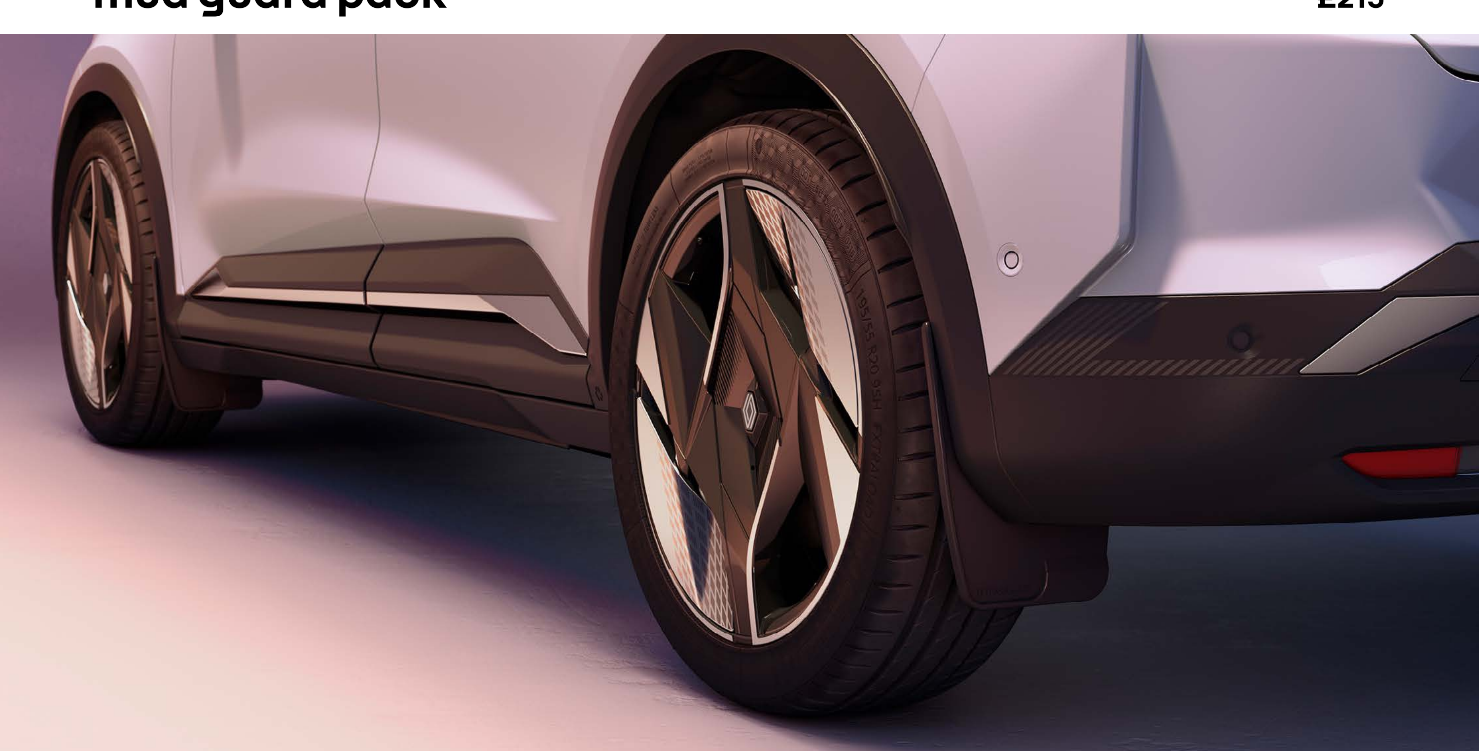
front and rear mud guards 7717274244