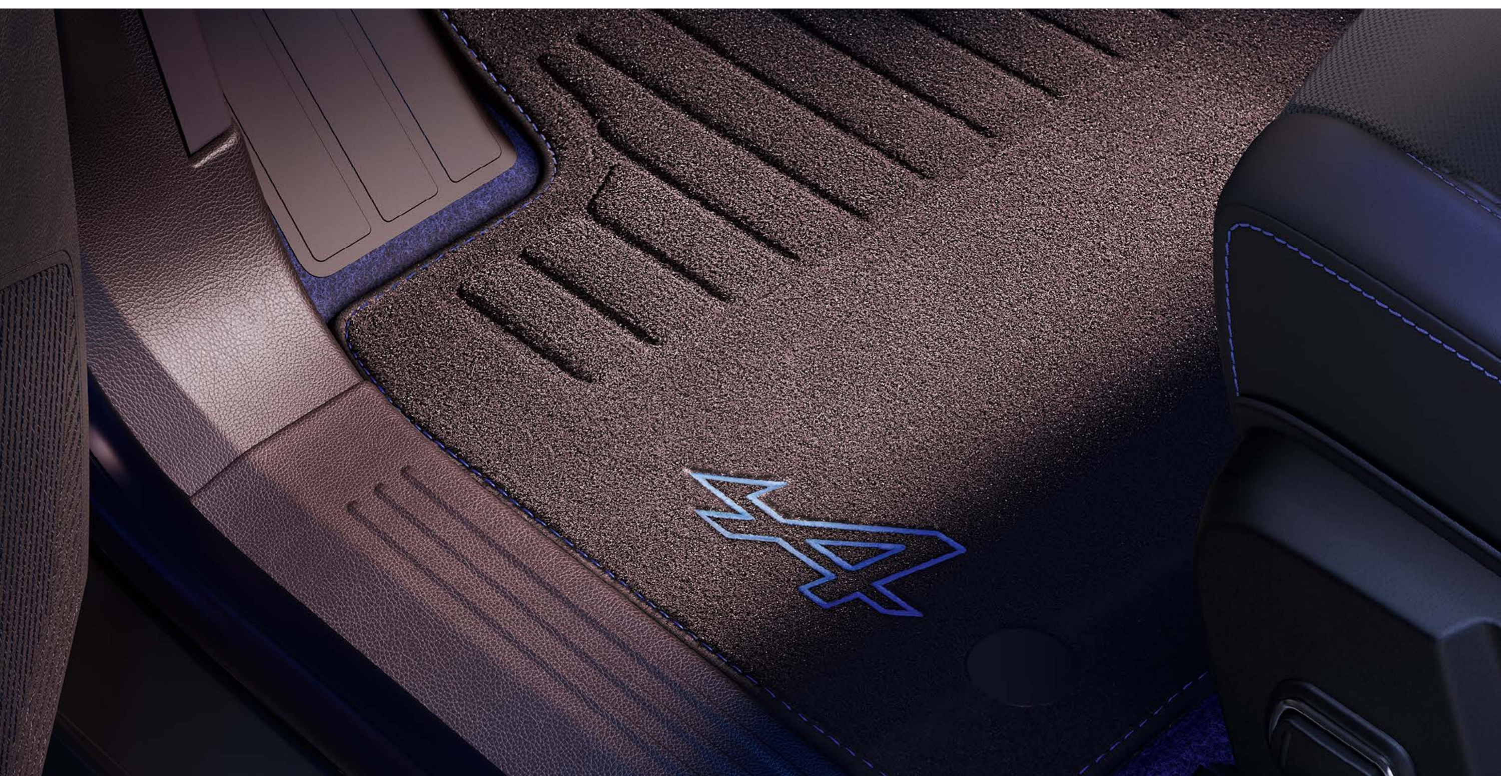
esprit Alpine mats