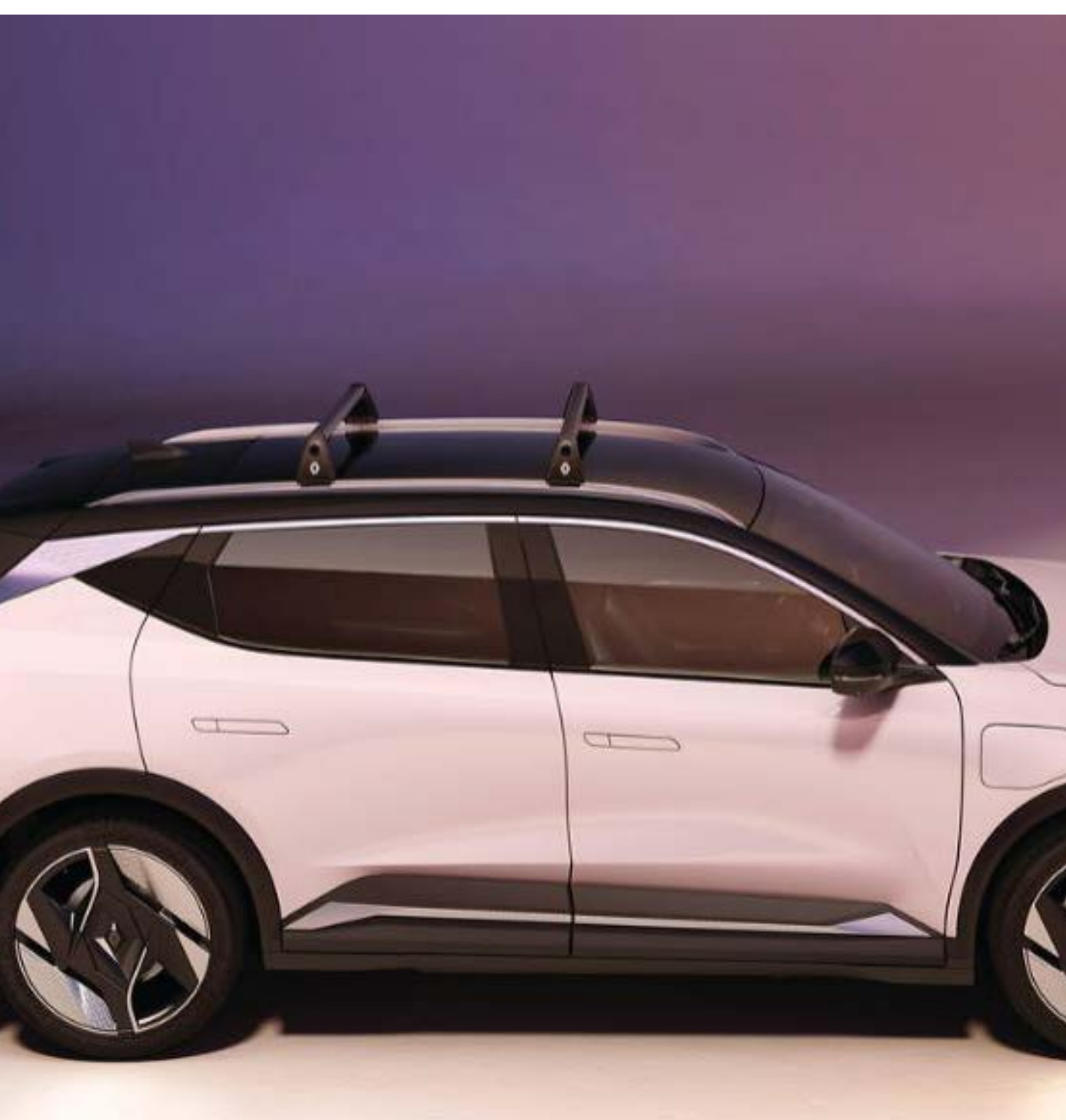
quick fix longitudinal roof bars 738207220R