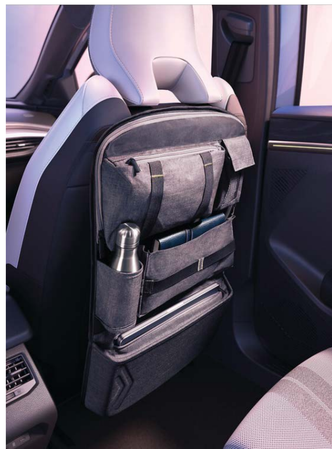
seat organizer 7711948825

The Renault mudguards protect the underbody and wheels from water, mud splatter and flying gravel.