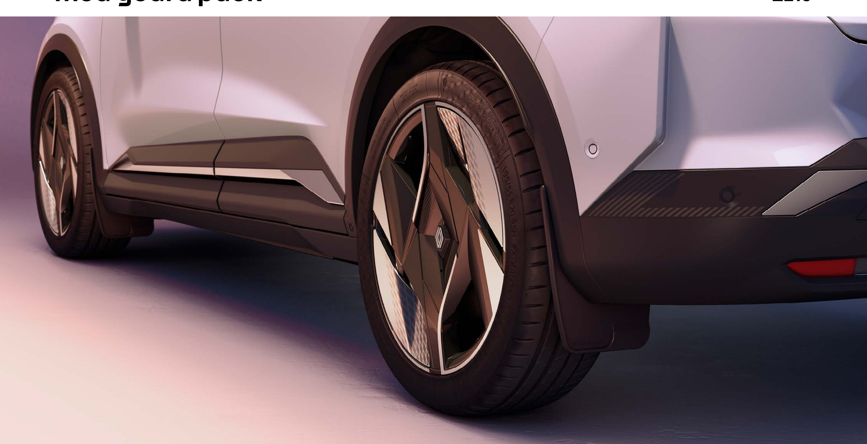
front and rear mud guards 7717274244