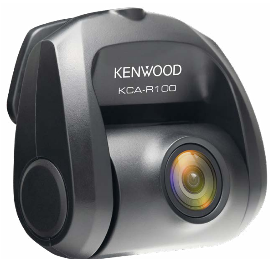
KENWOOD rear cam 7711599212