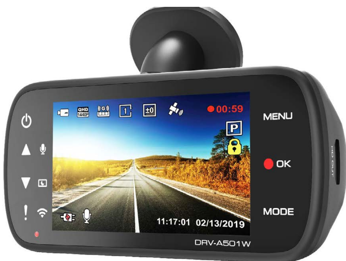
KENWOOD front dash cam 7711599197