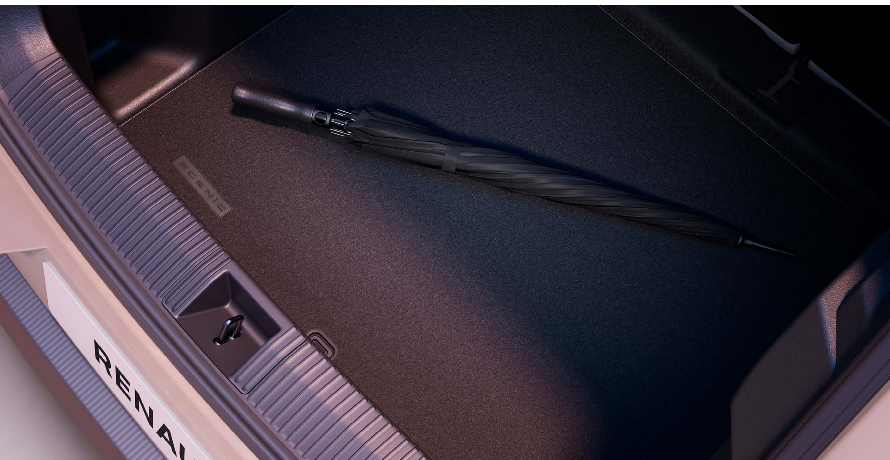
boot liner 849P74058R