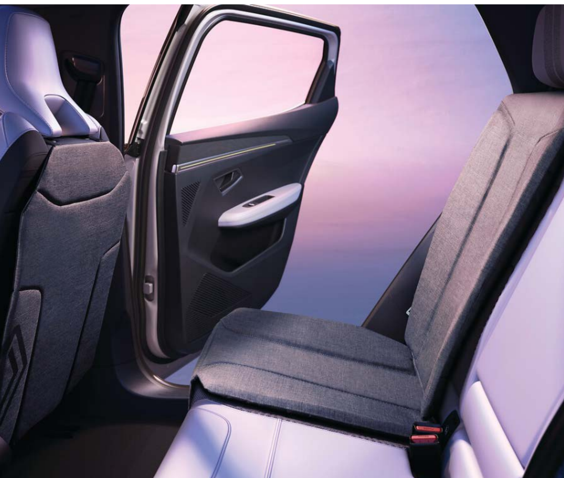
child seat protector + kick mat 7717300448