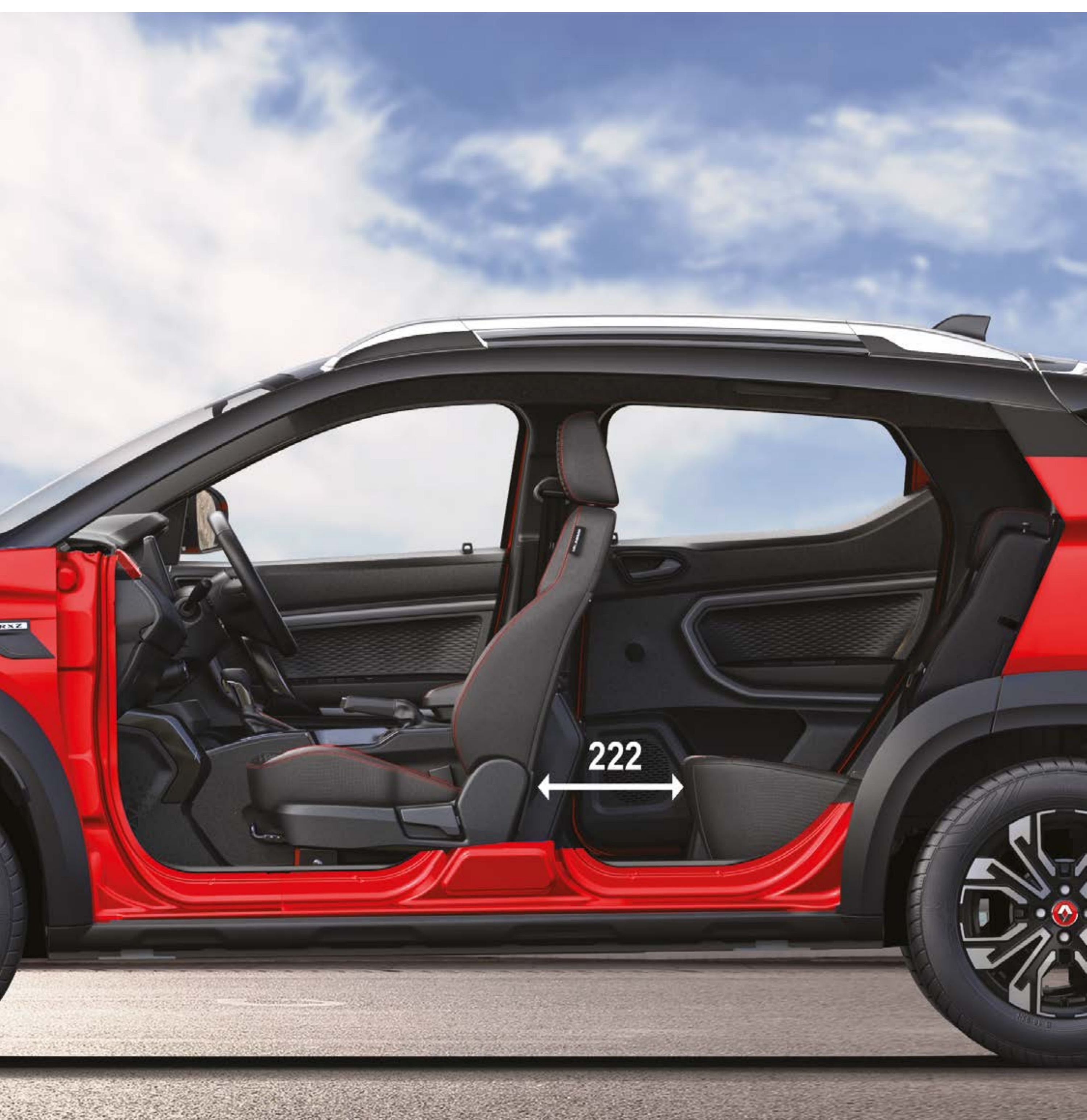
rear knee room of 222 mm

From its premium, modern upholstery to its spacious cabin, everything about Renault Kiger spells comfort. Settle in comfortably and enjoy every drive.