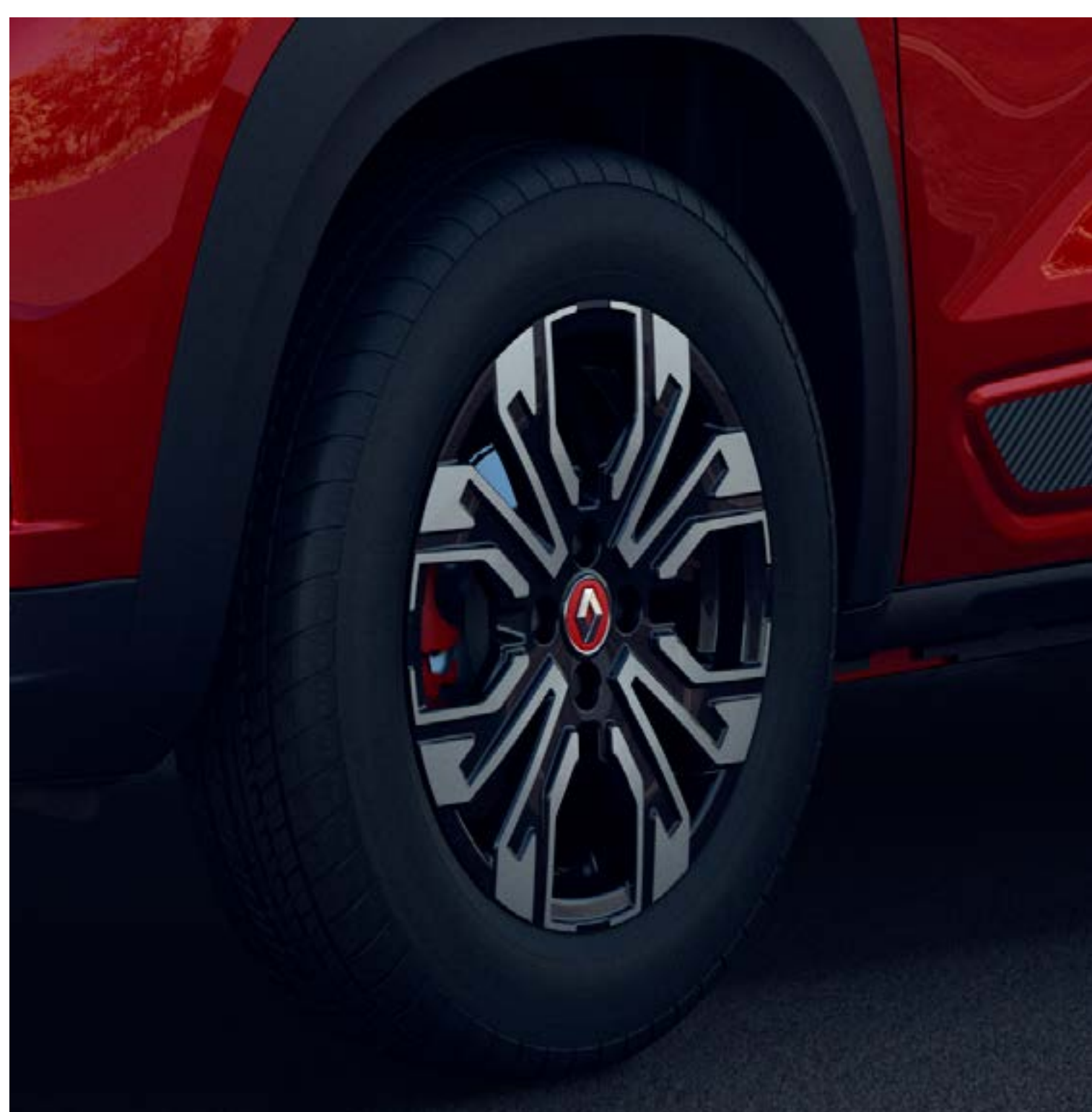
40.64 cm diamond cut alloy wheels