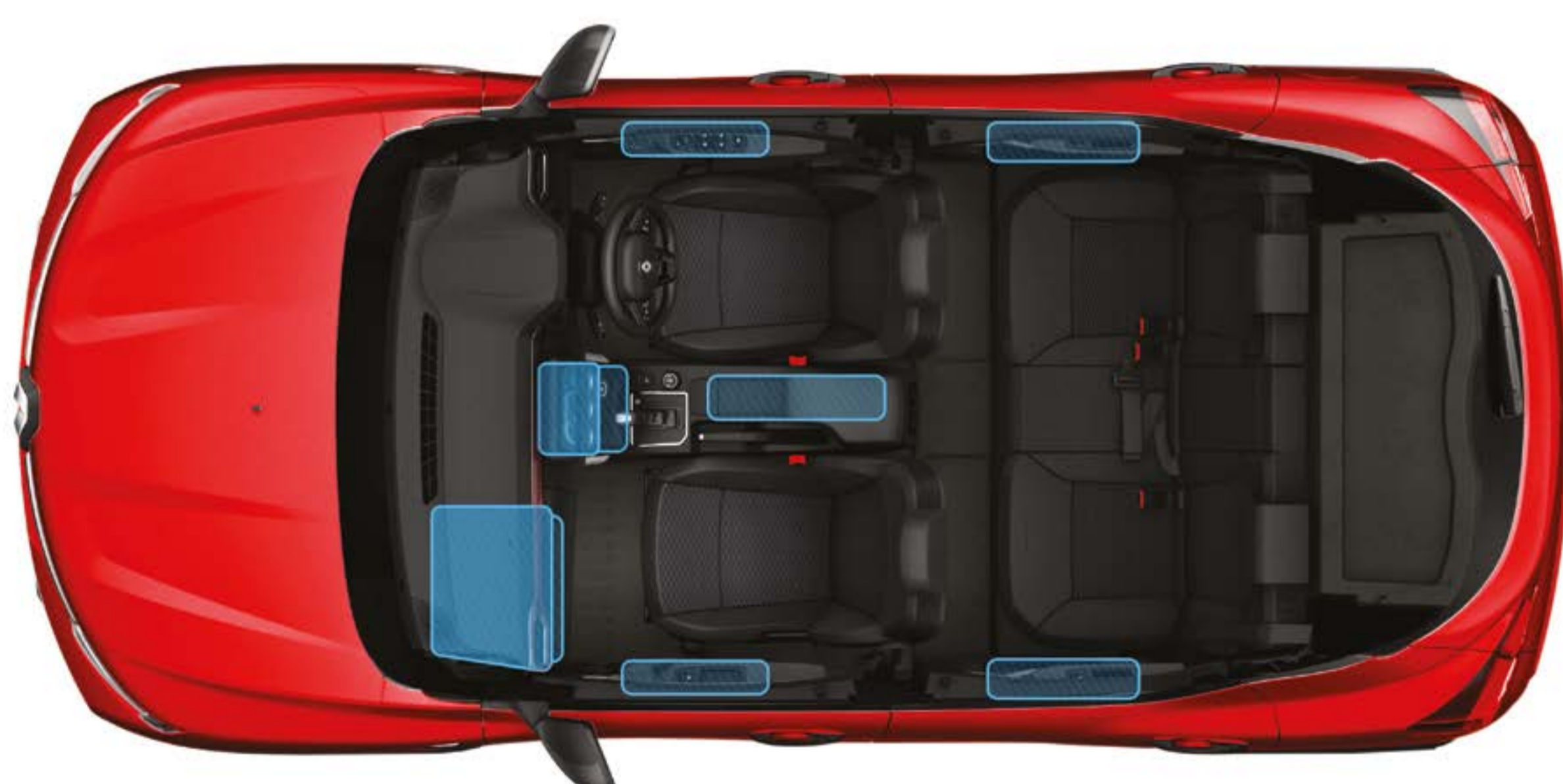
total cabin storage volume of 29-litres

Discover the practical side of Renault Kiger. This SUV comes with a generous 405-litre boot space and ample cabin storage for you to house all your essentials easily.