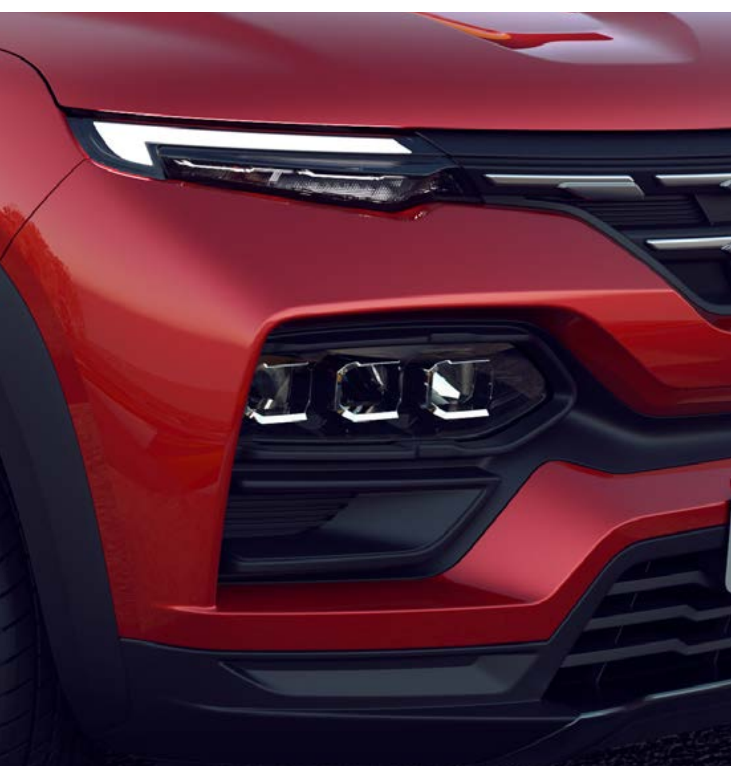
tri-octa LED pure vision headlamps

The finest details, like the chrome front grille, 40.64 cm diamond cut alloy wheels, sporty red calipers, rear spoiler, and LED headlamps with LED DRLs, reflect the SUV's cohesive design philosophy.