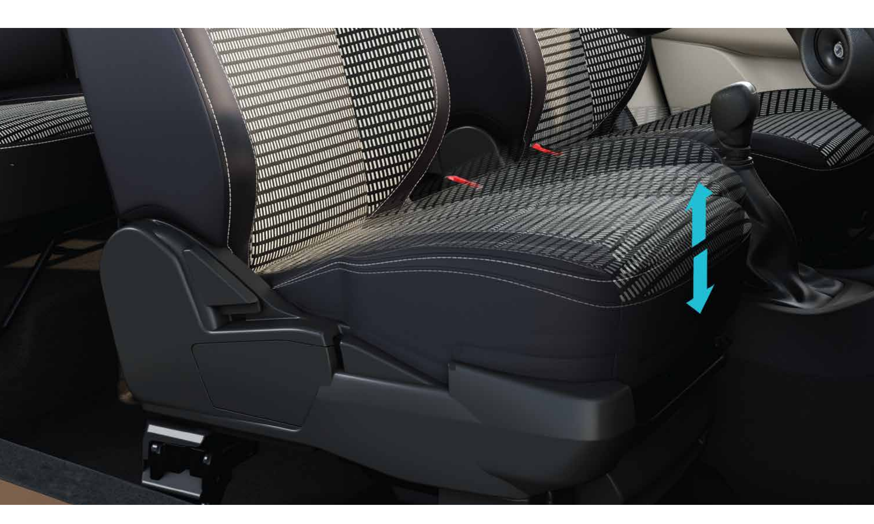
six way adjustable driver seat