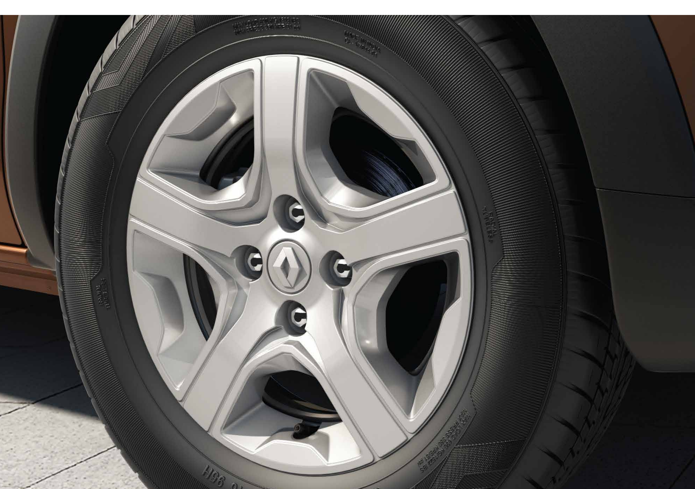
styled flex wheels