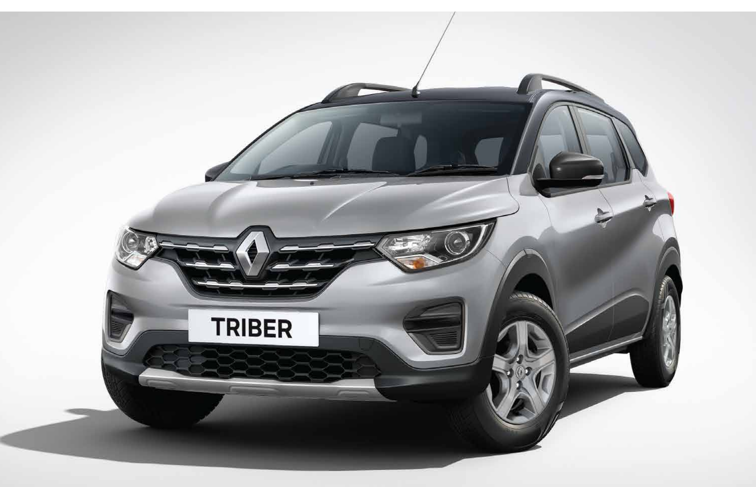
moonlight silver with mystery black roof