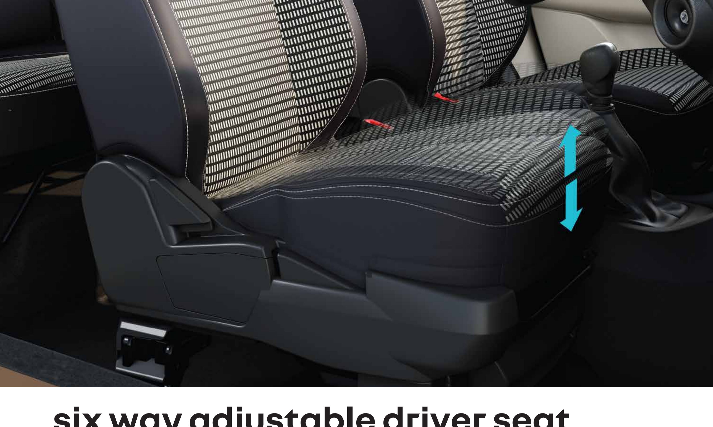
six way adjustable driver seat