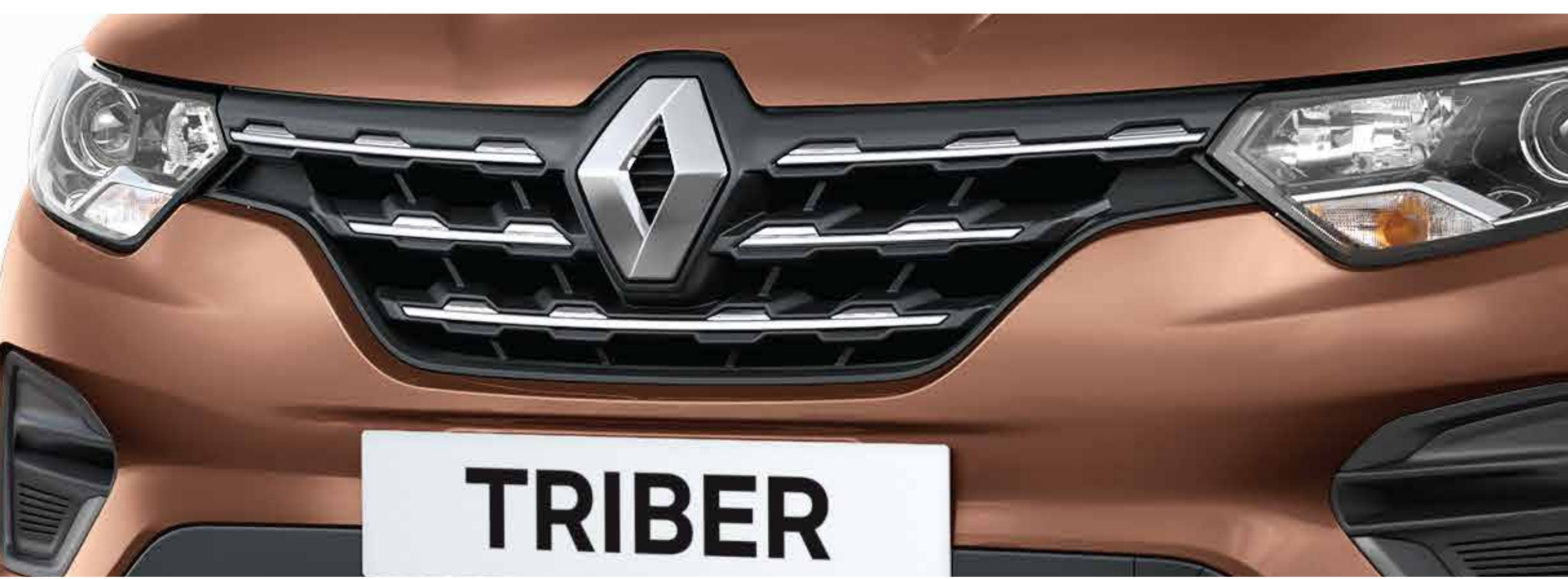
triple edge chrome front grille

Hit the road in style with the New Renault TRIBER Limited Edition. With an exterior that is sure to spark the admiration and envy of everyone passing by, this Limited Edition ride comes with a host of new additions to up its already incredible style game.