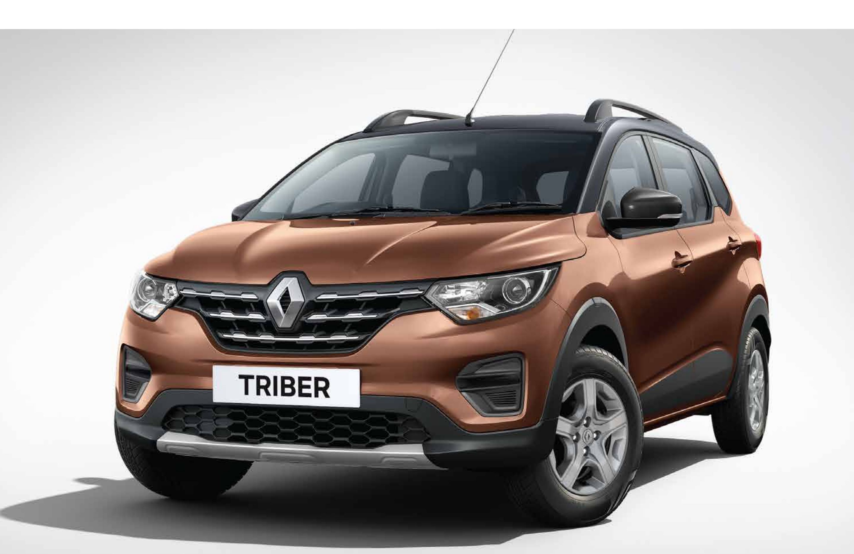
cedar brown with mystery black roof