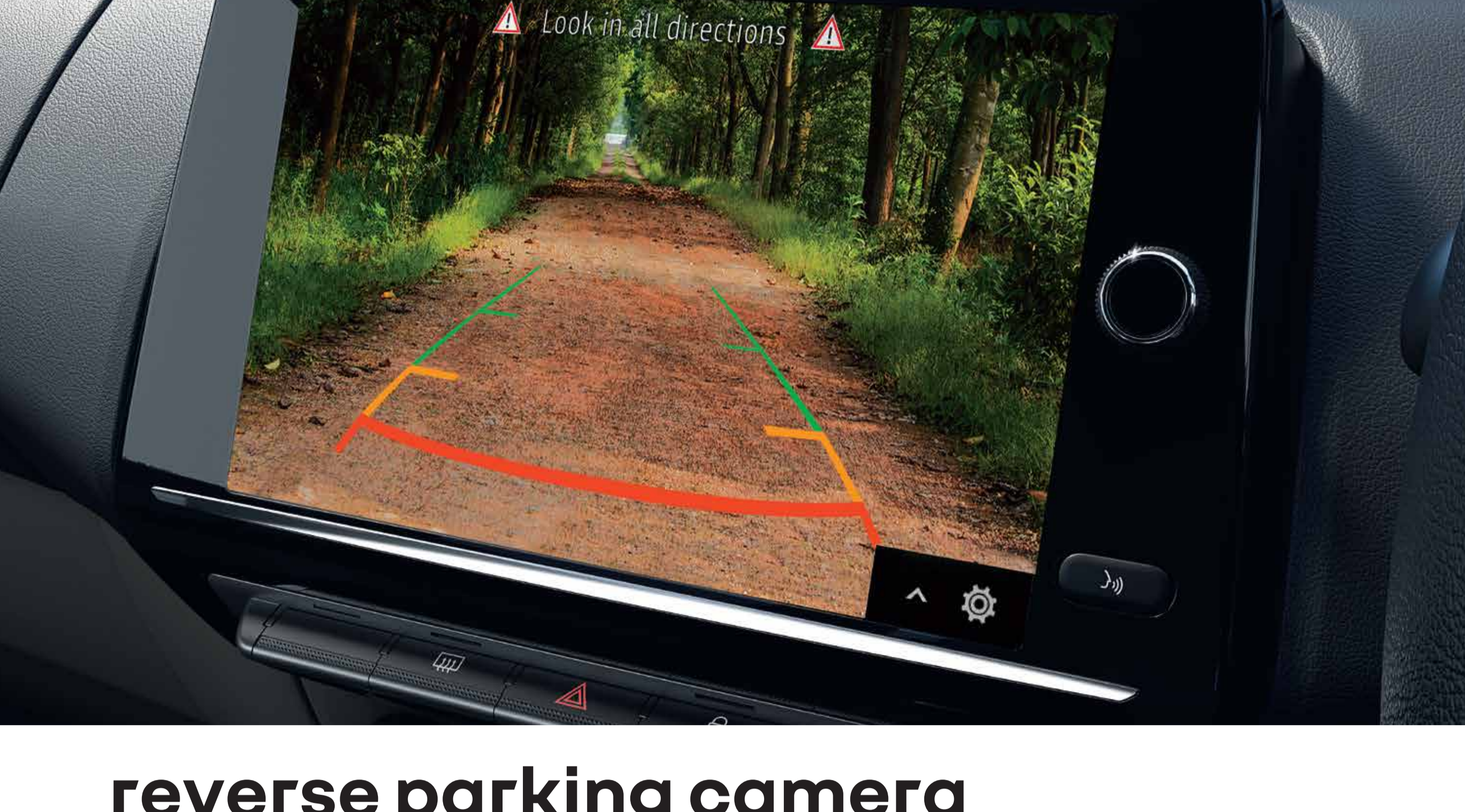
reverse parking camera with guidelines

Before anything else, the Renault TRIBER Limited Edition merges best-in-class technology with a design that prioritises your safety and comfort. With Front and Side Airbags – Driver & Passenger, Reverse Parking Camera with Guidelines, Six Way Adjustable Driver Seat, and a Twin AC with 2nd/3rd Row Vents & Independent Control, you can drive assured that your ride will have your back.