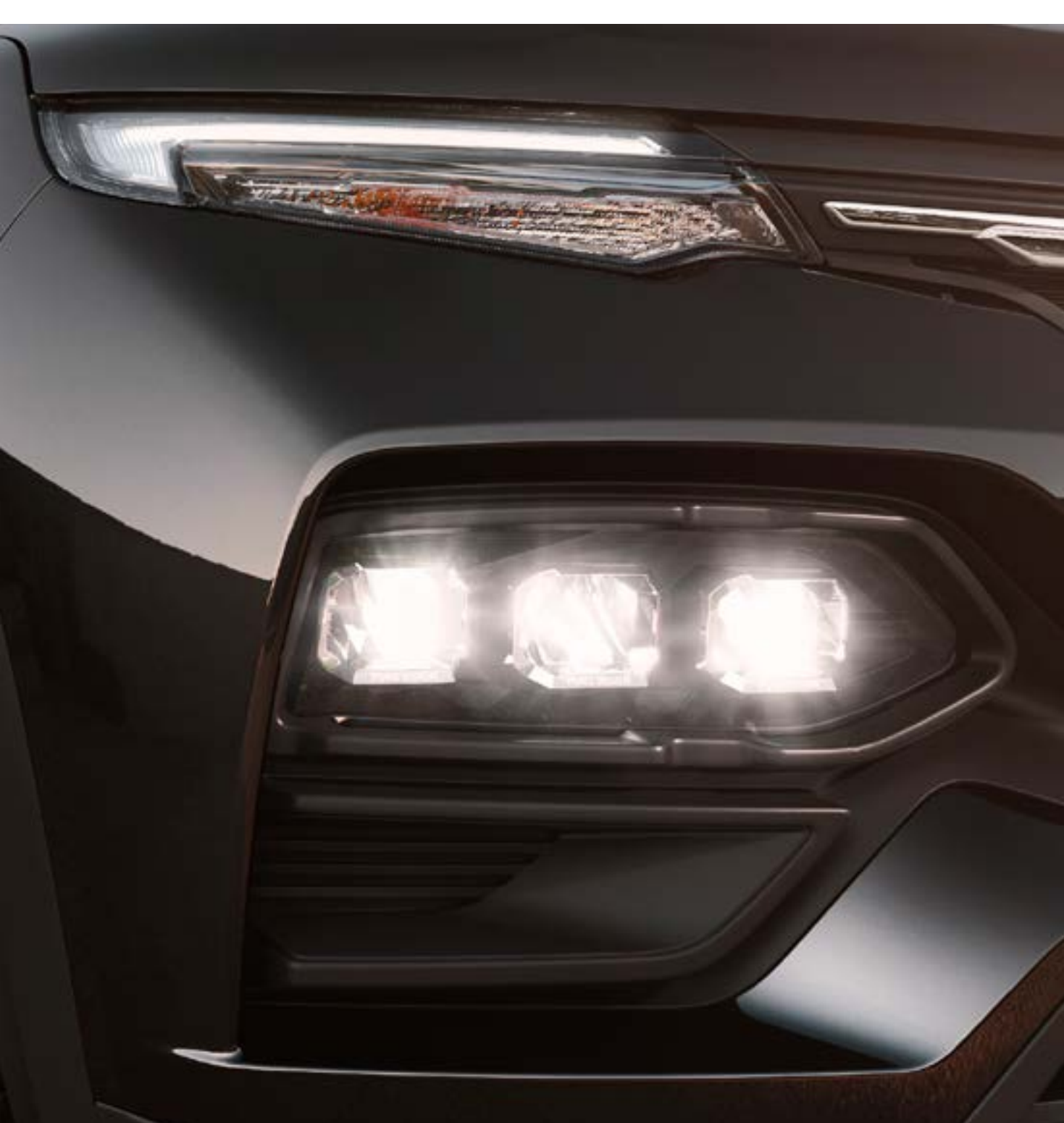
tri-octa LED pure vision headlamps

The finest details, like the chrome front grille, 40.64 cm diamond cut alloy wheels, sporty red calipers, rear spoiler, and LED headlamps with LED DRLs, reflect the SUV's cohesive design philosophy.