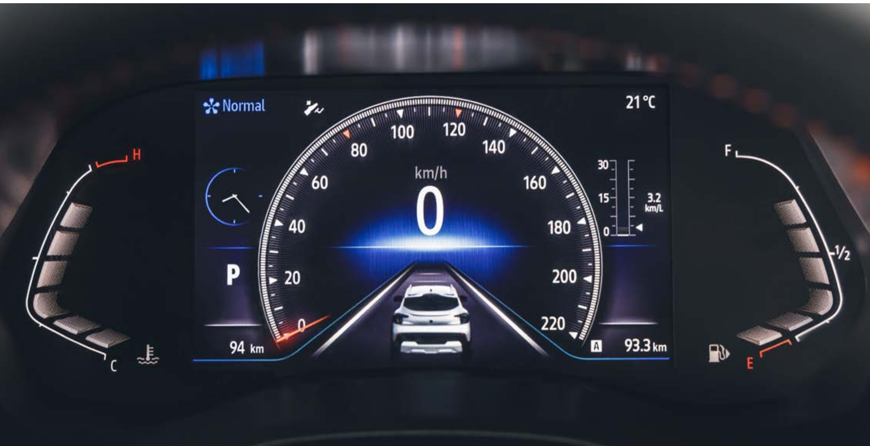
17.78 cm reconfigurable TFT cluster

Take control of your adventures, be it in the city or out on the highway. Cruise in the normal mode, switch to the fuel-efficient, eco mode or enjoy dynamic driving with sport mode.