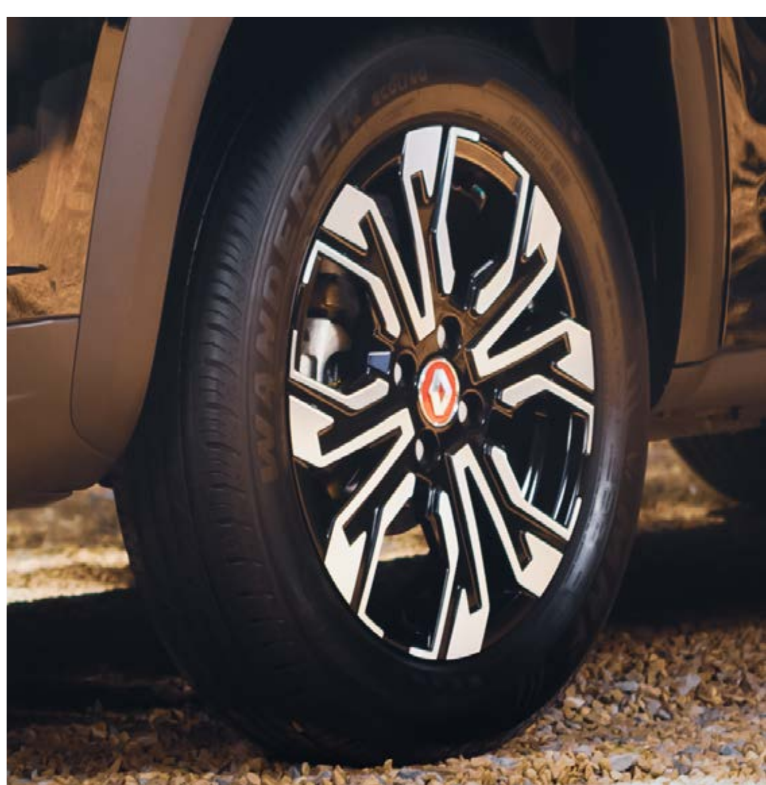
40.64 cm diamond cut alloy wheels