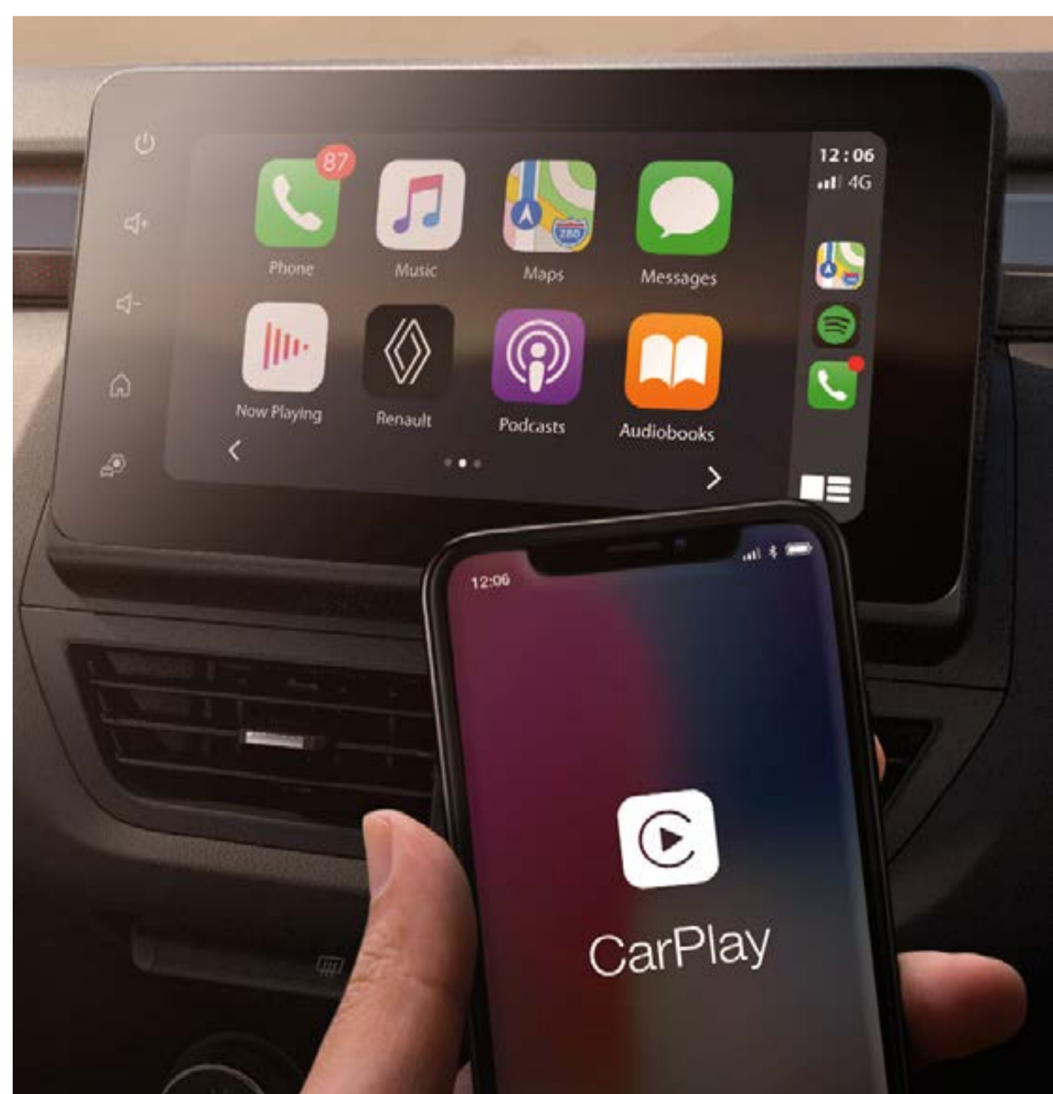
wireless smartphone replication with Android Auto™ and Apple CarPlay™