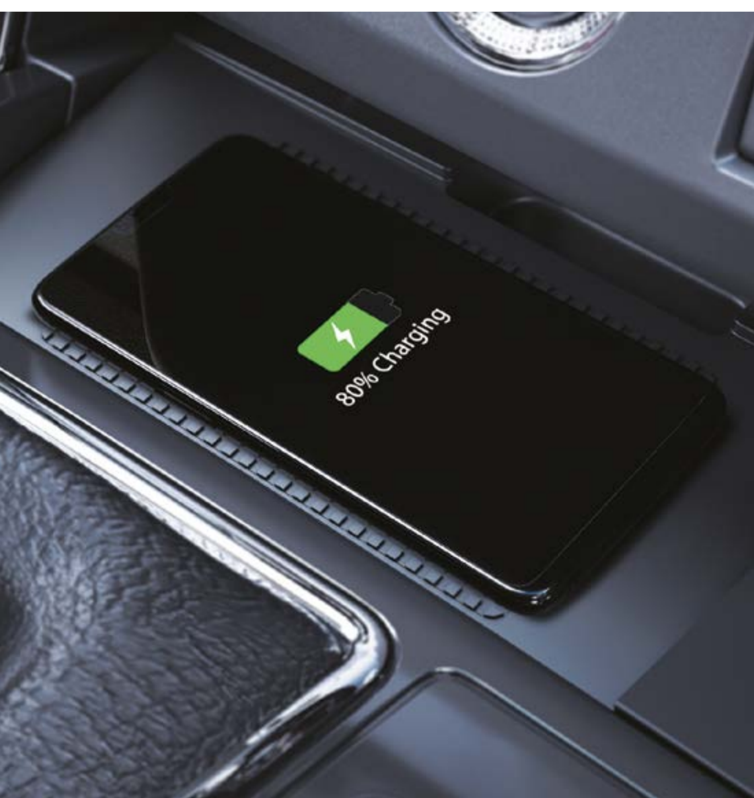
wireless smartphone charger

Begin your journey with a push of the start button. Seamlessly link your smartphone to the 20.32 cm floating touchscreen via wireless replication, all while it charges wirelessly. Elevate your comfort with the take-a-break reminder, which prompts you to pause for refreshing stops on long drives.