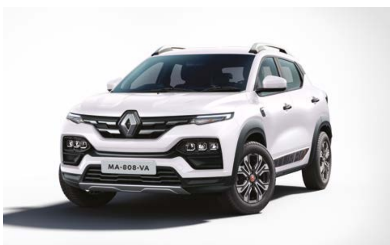
ice cool white