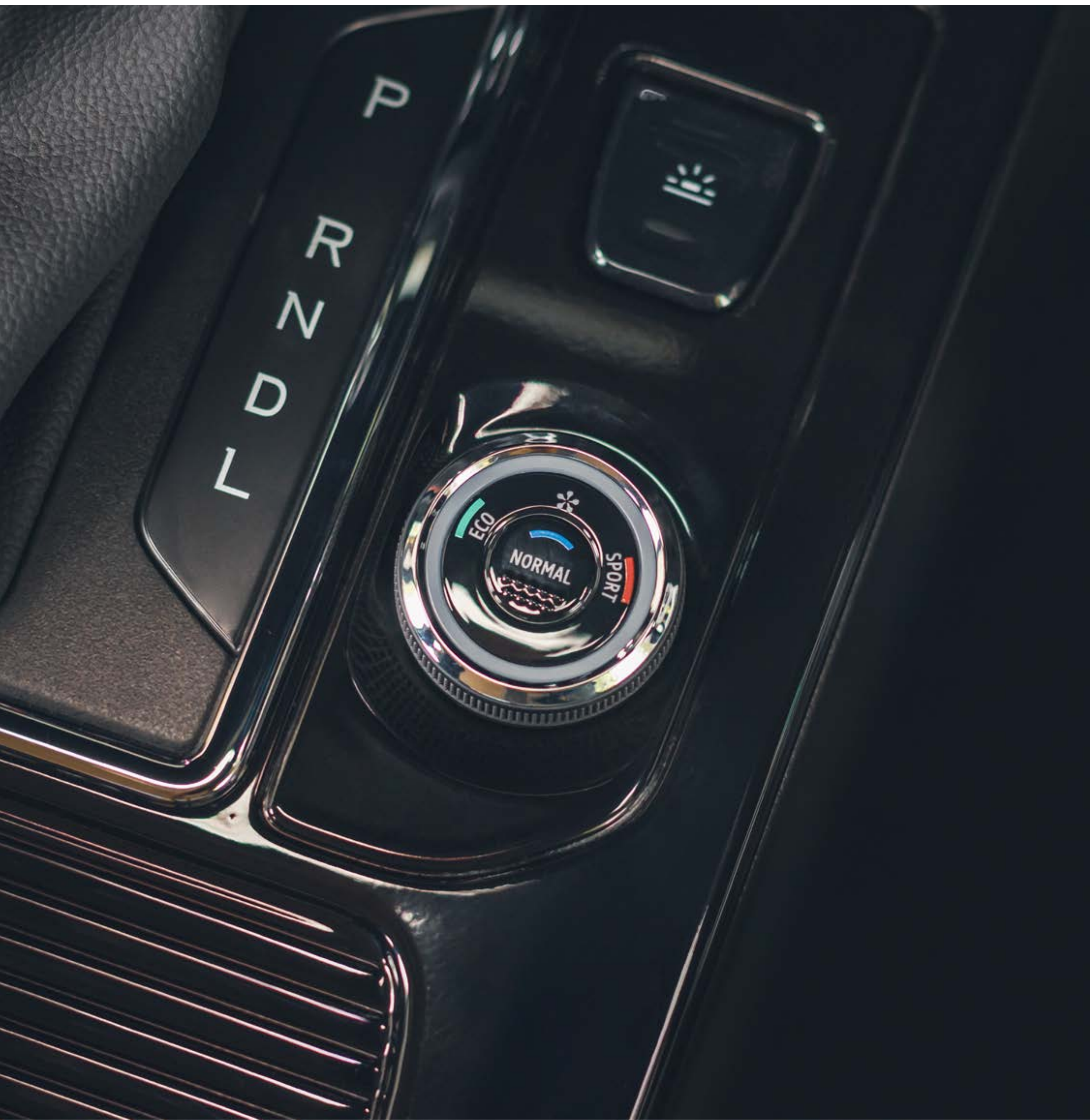
multi-sense drive mode

Experience a host of responsive features designed for a bold SUV. With a turbo-charged engine under the hood and an effortless driving experience enhanced by multi-sense drive modes, Renault Kiger truly combines the best of performance and efficiency.