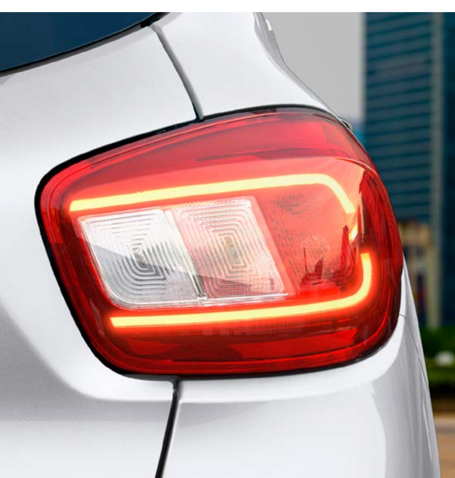
tail lamps with LED light guides