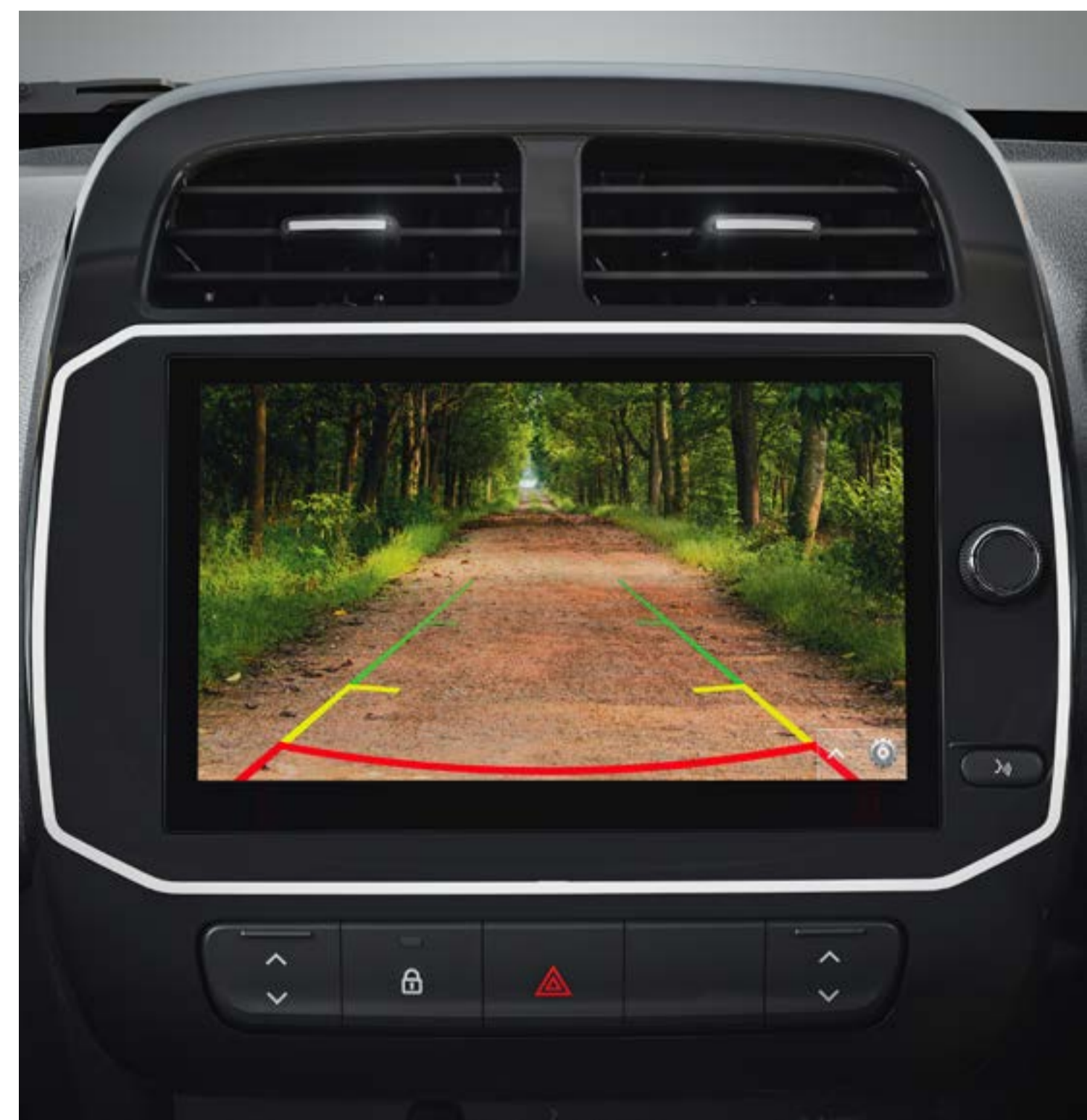
20.32 cm touchscreen mediaNAV