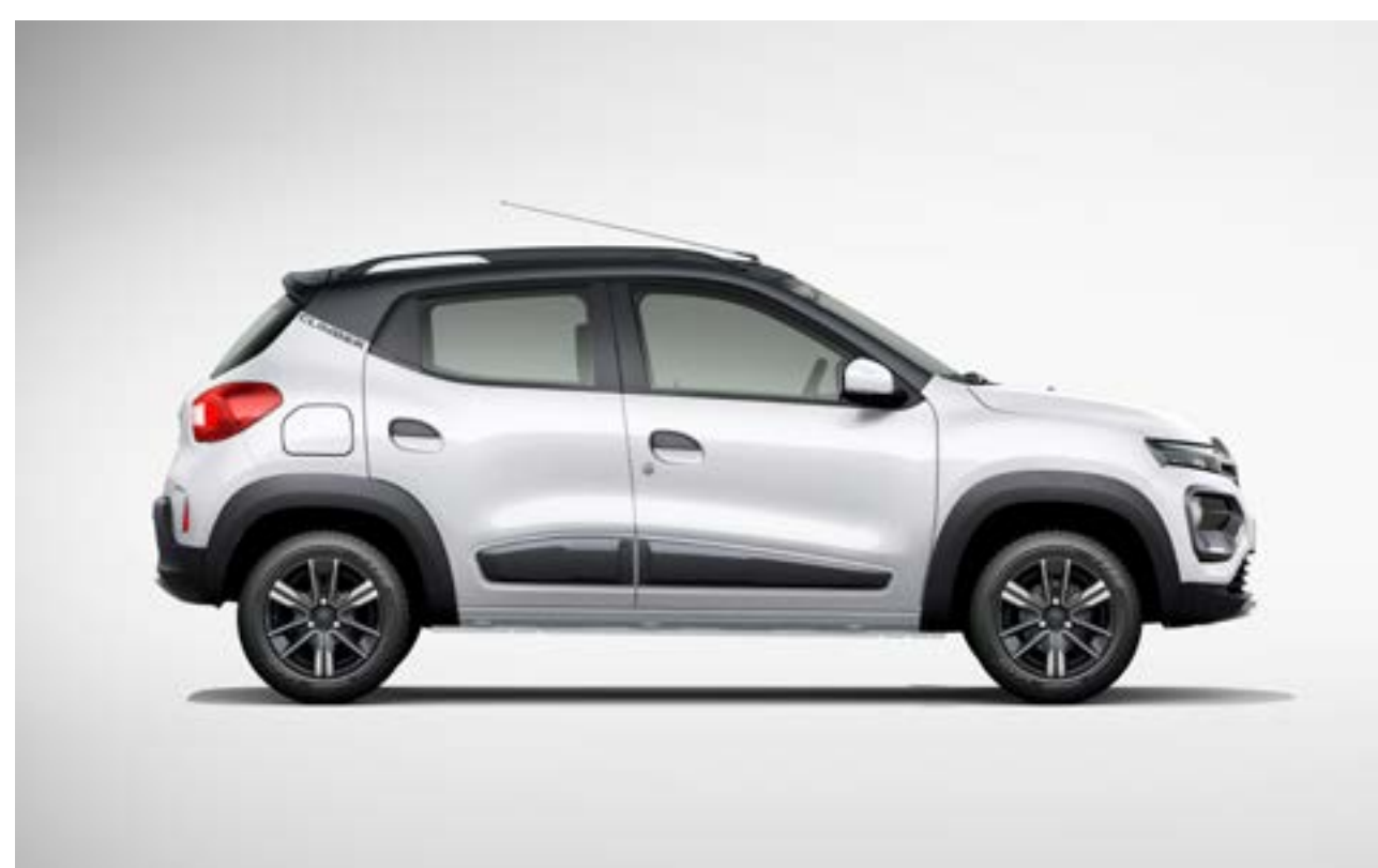
ice cool white