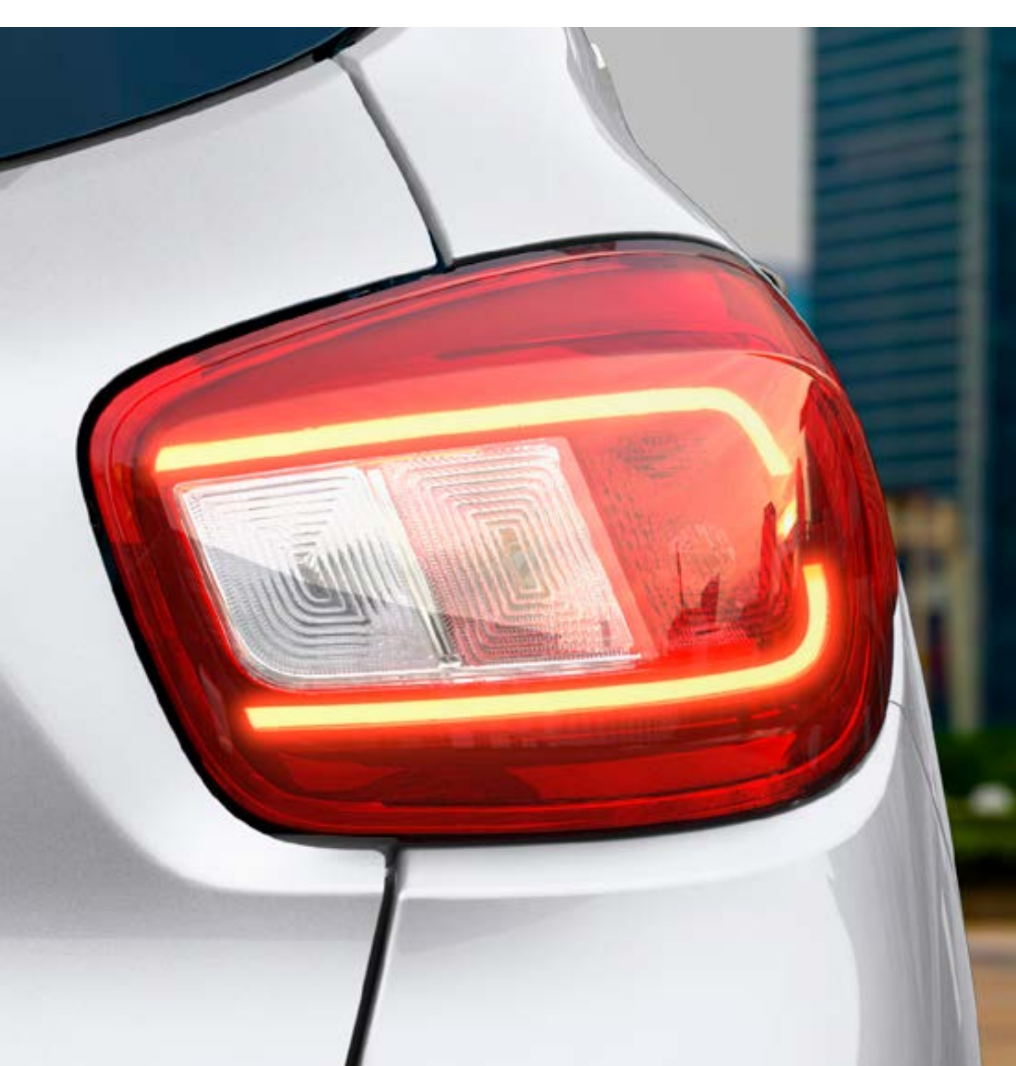
tail lamps with LED light guides