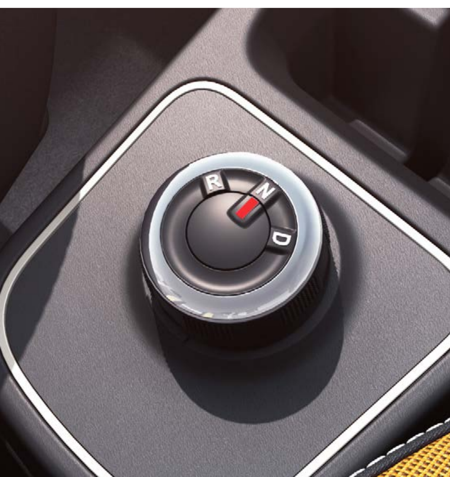
floor console mounted AMT dial