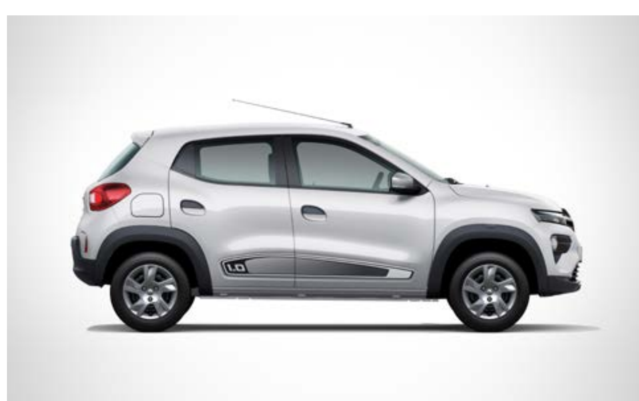
ice cool white