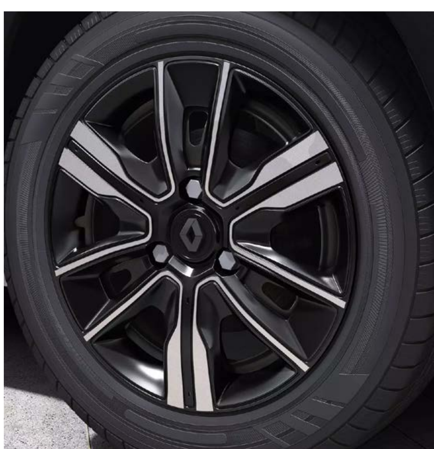
dual tone multi-spoke flex wheels