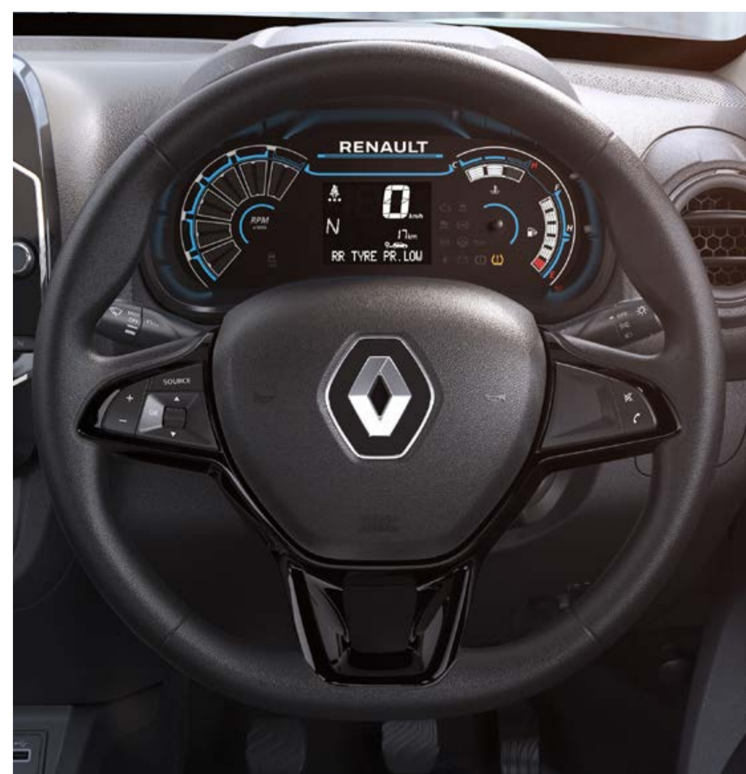
steering mounted audio controls