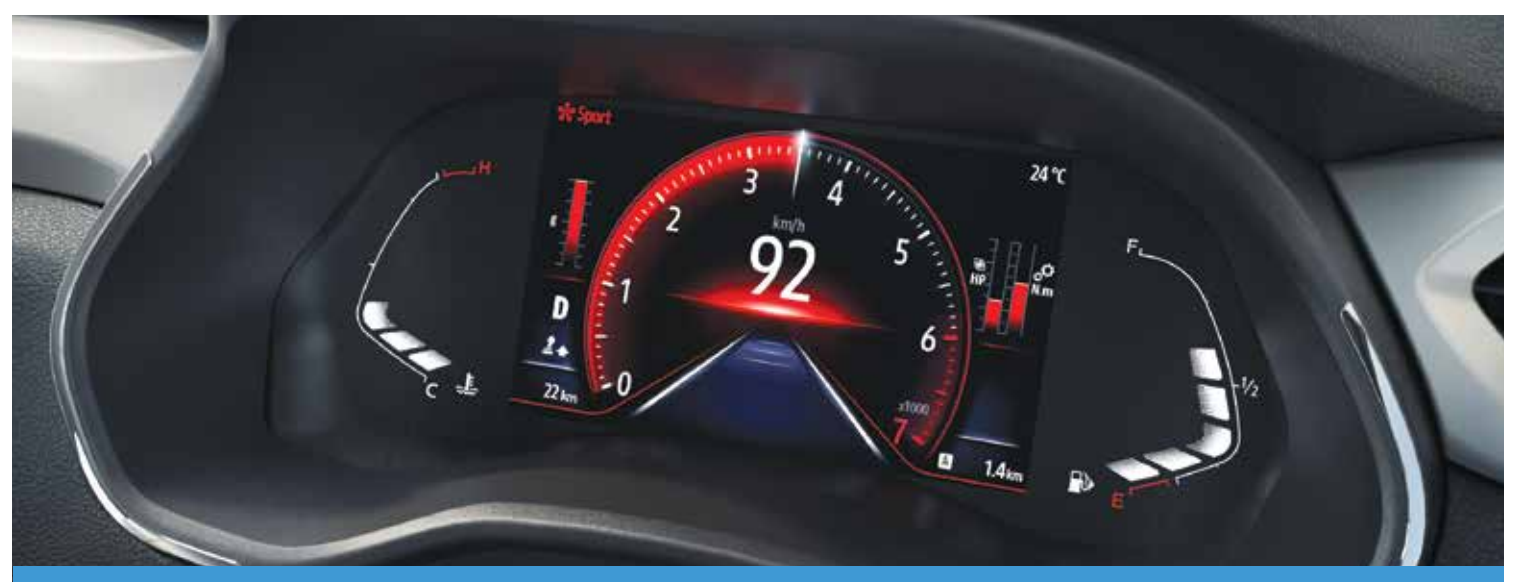
multi-skin 17.78 cm reconfigurable TFT cluster

high tensile steel body with anti-roll bar