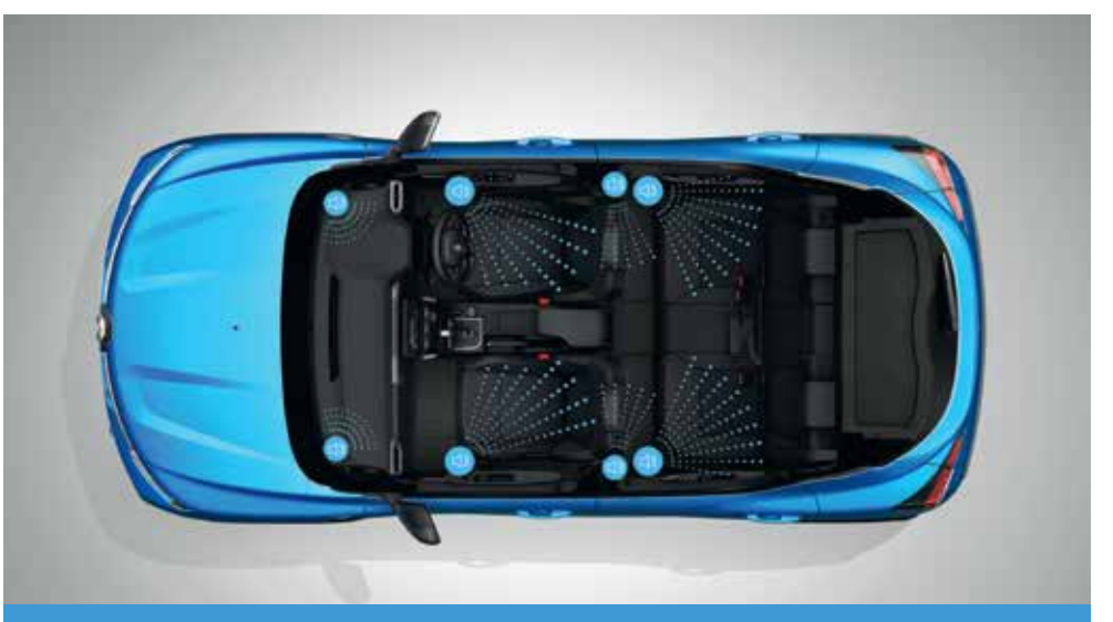
3D sound by ARKAMYS<sup>®</sup> (4 speakers + 4 tweeters)

The Renault KIGER's smart interiors are designed to make every trip memorable. It features Android Auto/Apple CarPlay with wireless smartphone replication and 3D sound by ARKAMYS® (4 speakers + 4 tweeters) for an exciting in-car entertainment experience. Smart technology inside continues in Push Start/Stop, Smart Access Card, rear view camera and Auto AC with a PM2.5 clean air filter.