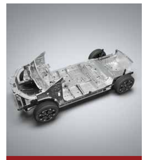
high tensile steel body with anti-roll bar