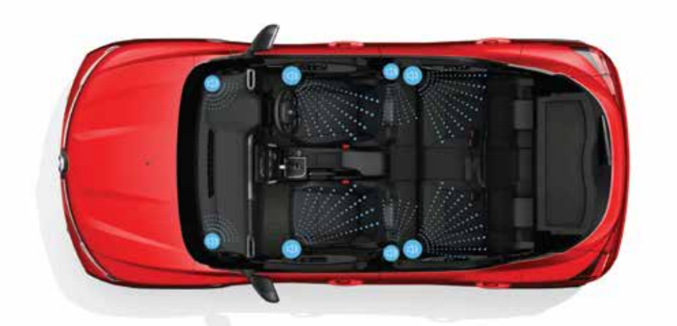
3D sound by ARKAMYS® (4 speakers + 4 tweeters)

The Renault KIGER's smart interiors are designed to make every trip memorable. It features Android Auto/Apple CarPlay with wireless smartphone replication and 3D sound by ARKAMYS® (4 speakers + 4 tweeters) for an exciting in-car entertainment experience. Smart technology inside continues in Push Start/Stop, Smart Access Card, rear view camera and Auto AC with a PM2.5 clean air filter.