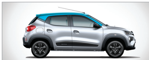
Moonlight Silver body colour with Zanskar Blue roof