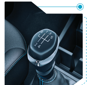
Stylised Gear Knob with Chrome Surround