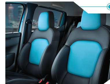
Black Bolster & Zanskar Blue Design Fabric Seat Upholstery