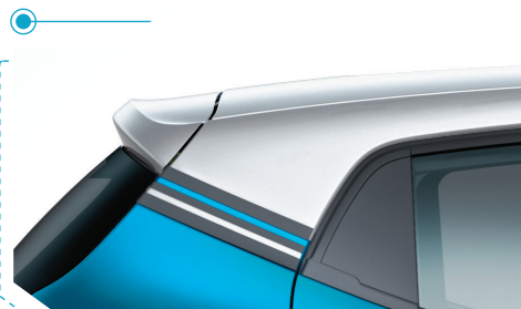
Trendsetting 3D Decals on C-Pillar