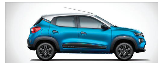
Zanskar Blue body colour with Moonlight Silver roof