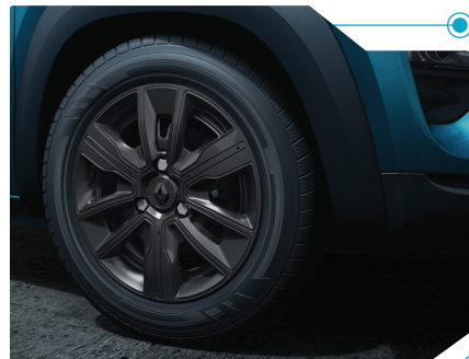
Muscular Multi Spoke Wheels - Volcano Grey