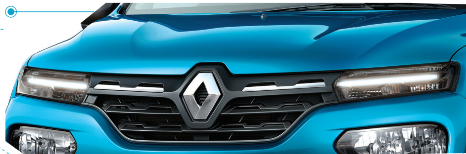
Stylish Grille with Chrome inserts