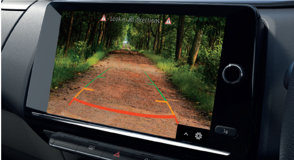
reverse parking camera with guidelines

Before anything else, the Renault TRIBER Limited Edition merges best-in-class technology with a design that prioritises your safety and comfort. With Front and Side Airbags – Driver & Passenger, Reverse Parking Camera with Guidelines, Six Way Adjustable Driver Seat, and a Twin AC with 2nd/3rd Row Vents & Independent Control, you can drive assured that your ride will have your back.