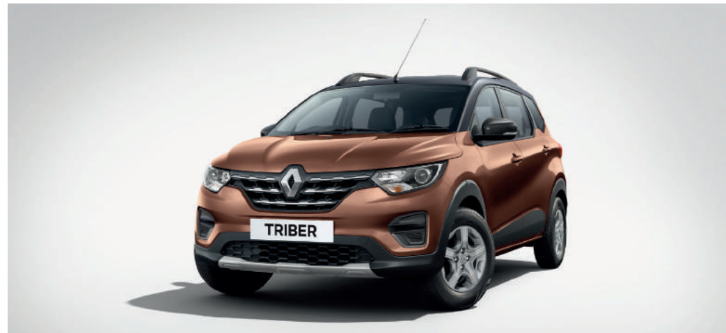
cedar brown with mystery black roof