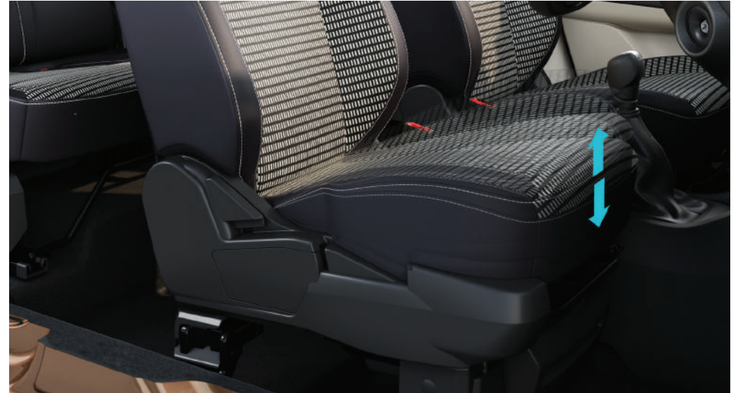
six way adjustable driver seat