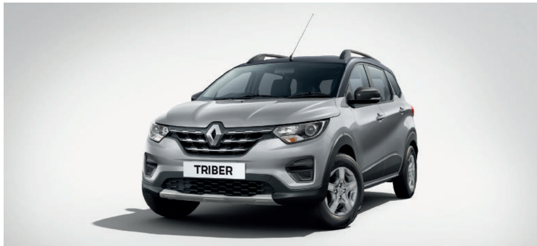
moonlight silver with mystery black roof