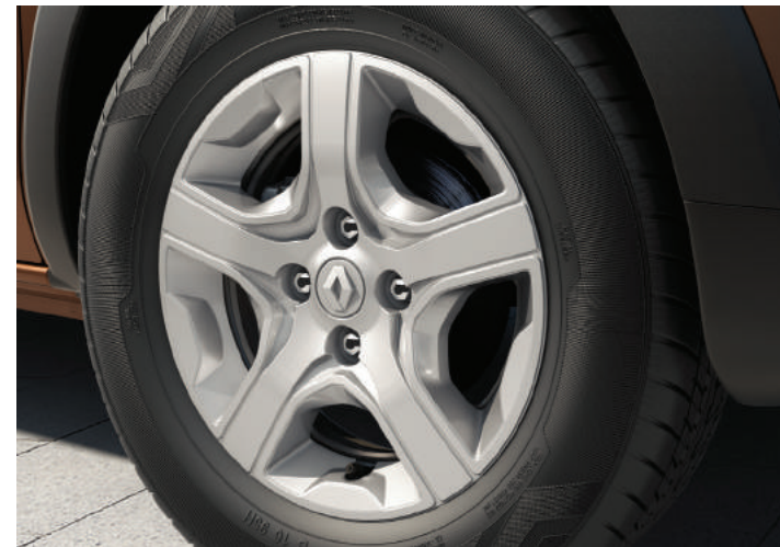
14" styled flex wheels