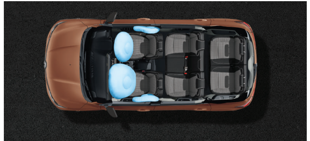
front and side airbags – driver & passenger