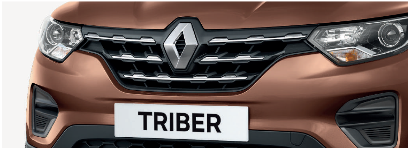
triple edge chrome front grille

Hit the road in style with the New Renault TRIBER Limited Edition. With an exterior that is sure to spark the admiration and envy of everyone passing by, this Limited Edition ride comes with a host of new additions to up its already incredible style game.